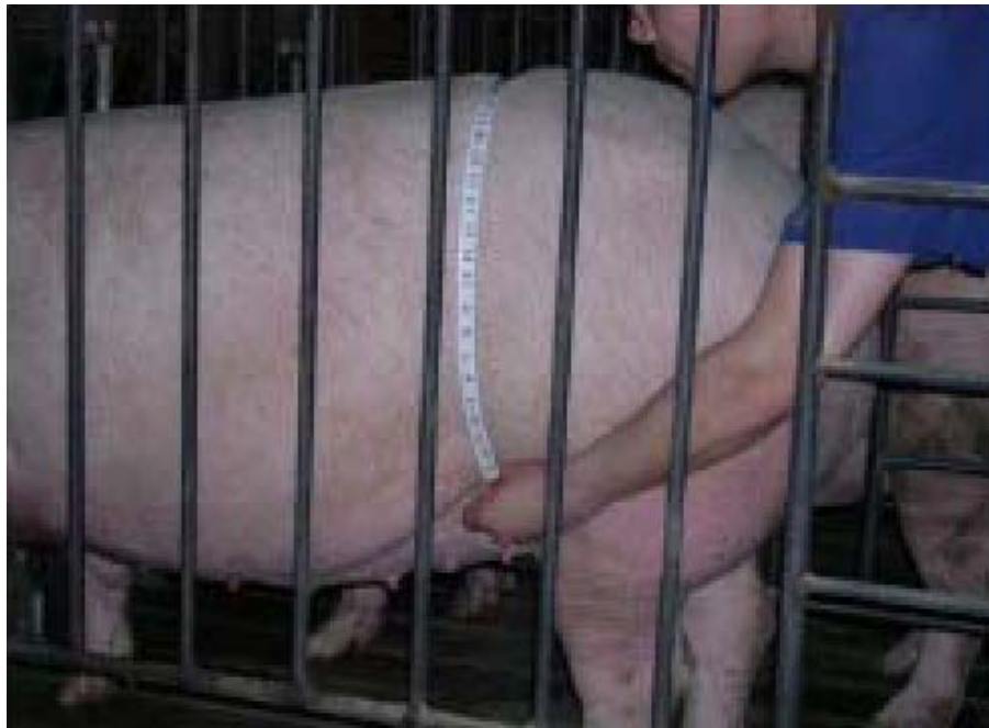
Figure 1. Flank-to-flank Measurement.

vious data from sows and growing-finishing pigs suggest that the relationship between flank-to-flank measurement and body weight is non-linear in a lower weight range. With this, a linear model will not be appropriate for estimating a wider range of pig weights. The sow allometric equation can be used as the final model in estimating pig weights because it has been developed and tested on a larger database, a wide range of weights (50 – 350 kg), more genetic lines, and both sexes of pigs. The final model in estimating pig weights by using flank-to-flank measurement is the sow model (Equation 3).