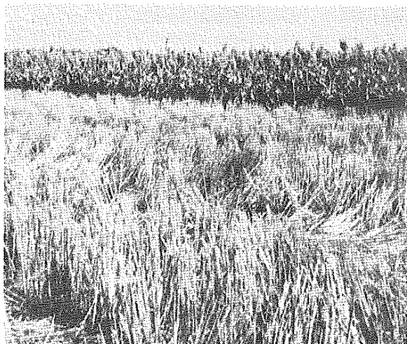
Fig. 2. Research plots at Tribune Branch Experiment Station showing weed-free wheat stubble after herbicide was applied, with grain sorghum in the background grown after wheat with the same herbicide treatment, 1973.

other items such as interest must also be considered. Gross returns can be easily calculated from yields given in Table 2. Use current or expected commodity prices. In any event and with virtually any realistic price structure, it seems that FWS+ (1768 lb grain/a/yr) will net substantially more per acre than will FW (990 lb/a/yr).