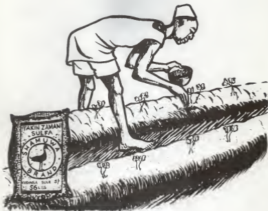
Fig. 6. Poster showing man applying ammonium sulphate fertilizer on cotton by placement method.