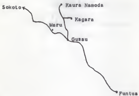
Fig. 3. Road map showing location of Gusau and two survey villages.