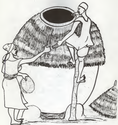
Fig. 4. Poster showing men preparing to clean a grain storage rumbu .