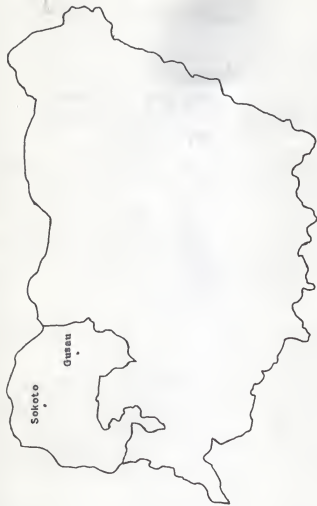
Fig. 1. Map of Northern Nigeria showing Sokoto Province.