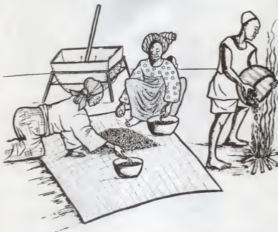
Fig. 5. Poster showing women separating groundnuts and men burning the bad nuts.