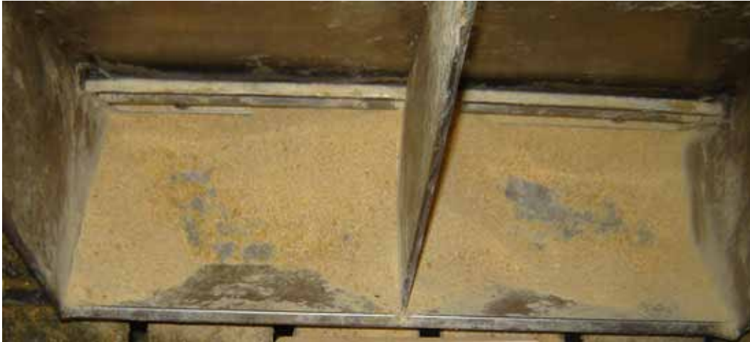
Figure 2. Wide feeder adjustment (minimum feeder-gap opening was 1.00 in. with a maximum gap of 1.25 in.) averaged 83% feeder pan coverage.