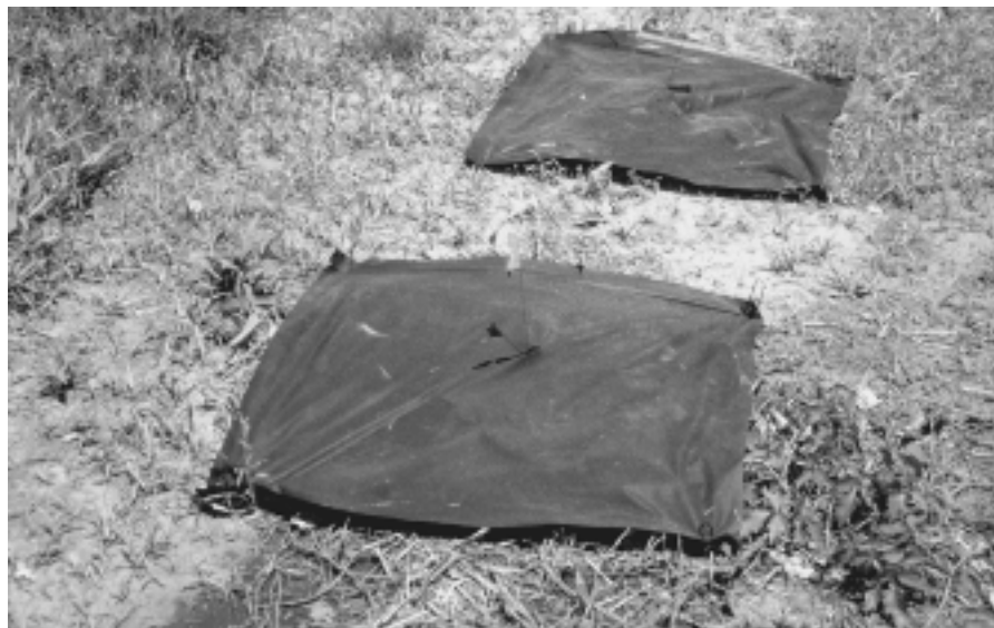
Figure 2. Example of using plastic weed barriers around individual trees. In this example, the barrier has been cut in a 4 by 4 ft square, with a slit cut in the middle for planting the tree.

Application of synthetic weed barriers may be a desirable and practical management tool for establishing tree stands in the Great Plains. They provide an effective and economical alternative to herbicides and cultivation. Problems with girdling are not likely, but follow up is needed and appropriate measures should be taken if the mulches appear to be restraining diameter growth of the trees.