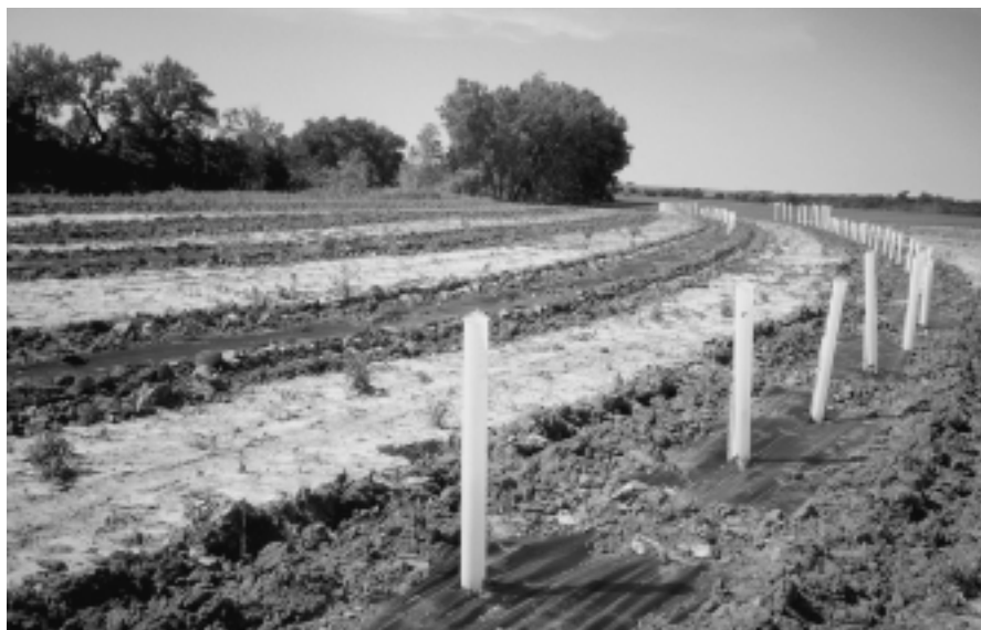
Figure 3. In this example, the weed barrier has been placed in strips, with trees planted in slits cut out of the center of the strip. Soil is tossed over the barrier at intervals to help hold it in place.