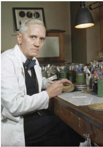
Figure 2: A picture of Fleming in his lab at St. Mary's

September 3, 1928, the day that would change medicine forever. This was the day that a scientist walked into his lab to find a mold growing in a culture of staphylococcus bacteria he had prepared. The scientist observed that the mold appeared to reverse the growth of the bacteria. 47 At first, he named his new discovery “mould juice” and later penicillin, after the scientific name of the mold he found, Penicillium notatum (now known as Penicillium chrysogenum ). 48 The scientist believed that this was a potential breakthrough in treating diseases that were similar to the staphylococcus and spent the next several years studying its properties and experimenting with it before public distribution began. 49