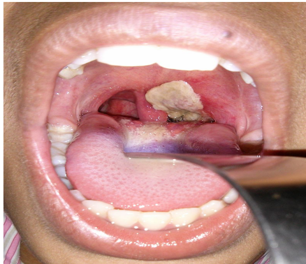
Figure 1: A Picture of a case of diphtheria. Note the lining on the esophagus. 13

an infection that mainly targets the genitals, rectum, and throat. 10 This infection causes swelling, pus-like discharge and painful passing of substances through the affected area. 11 Pneumonia, an infection of the lungs occasionally caused by bacteria, is another disease which penicillin treats. The disease causes difficulty breathing, pus, and a fever. 12