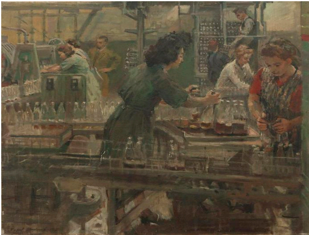
Figure 4: Women working in a Penicillin factory during World War II 85

thousand dollars to make one kilogram and took a complete day to produce. 81 The United States War Production Board saw the results of drug trials, and ordered large-scale production in 1943. The Board hoped to have a large supply of penicillin for Operation Overlord, the invasion of Normandy. 82 The pressing needs of the war effort and slow development time forced many companies to prioritize the distribution of penicillin to the military rather than civilian hospitals on the home front. 83 By the end of the war in 1945, almost seven trillion units of penicillin were made in the United States and Great Britain every year. This overshadowed the original production capacity of twenty-one billion units. 84