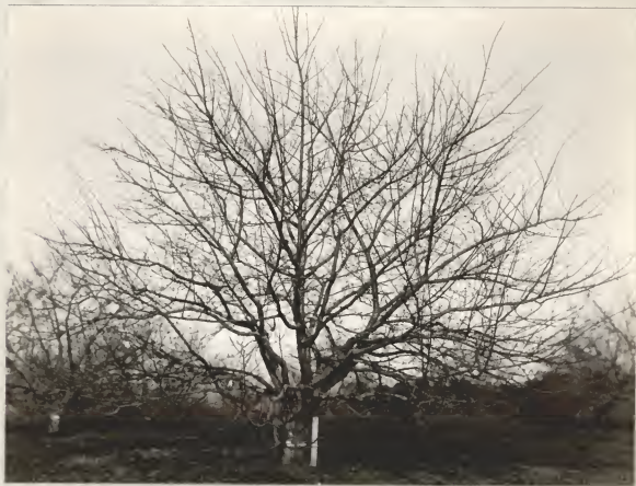
Figure 7. Stayman Winesap; tree spreading, moderately open with upright and moderately stout branches.