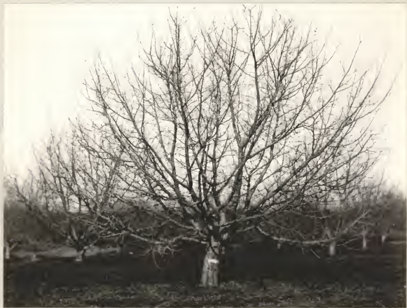
Figure 2. Grimes Golden; tree comparatively more compact and upright than Jonathan; branches moderately stout.