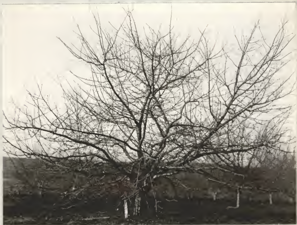
Figure 8. Arkansas; note the straggling growth of limbs, very open top and the pronounced stoutness of limbs.