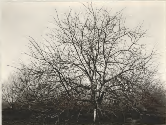
Figure 6. Winesap; note the pronounced genticulate growth of branches and twigs in outer half of tree.