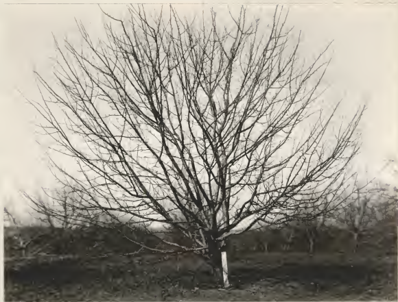
Figure 5. Delicious; tree vase shaped and compact with numerous straight branches; numerous characteristically straight young spurs.