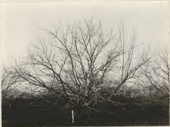
Figure 1. Jonathan; note the spreading and open form of the tree with long slender branches, especially in upper half.