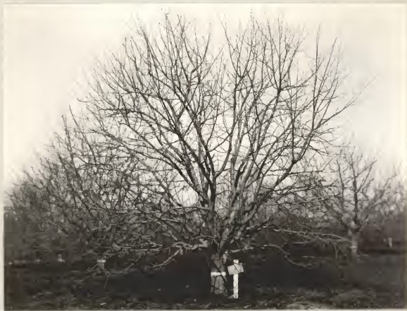
Figure 3. York Imperial; tree compact, upright and vase-shaped; branches stout with an abrupt change in diameter into the tip wood.