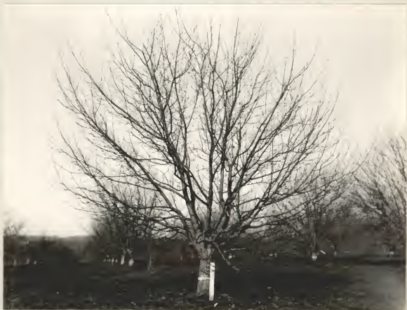
Figure 4. Gano; tree pronounced vase form; branches straight and thin.