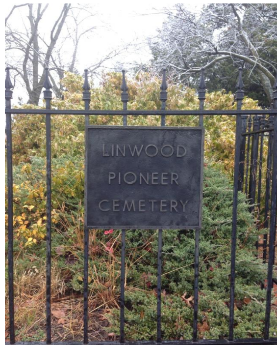
Figure 6: A Modern Photograph of the Linwood Pioneer Cemetery. Cemetery where John and Sarah Pincomb are buried.