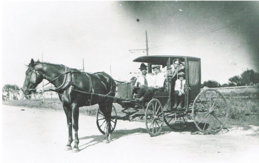
Figure 1: Charles Pincomb and sons in buggy with horse, southwest of Carriage House on Santa Fe Drive.

Chapman Center for Rural Studies, Fall, 2015