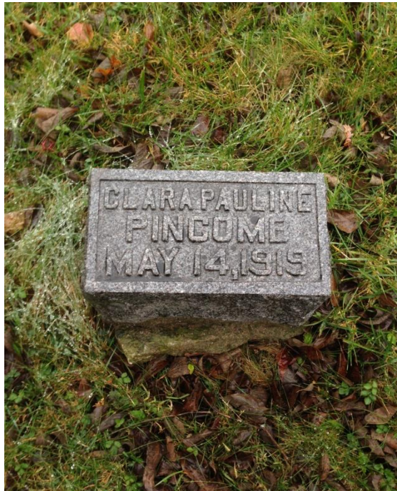
Figure 10: A modern photograph of the Clara Pauling Pincomb Tombstone. Located in the Corinth Cemetery, Prairie Village, Kansas.