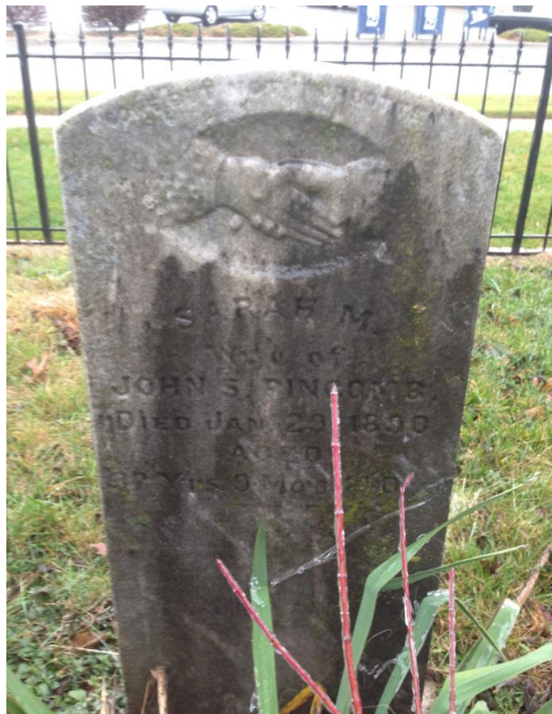
Figure 8: Modern photograph of the Sarah Pincomb Tombstone.