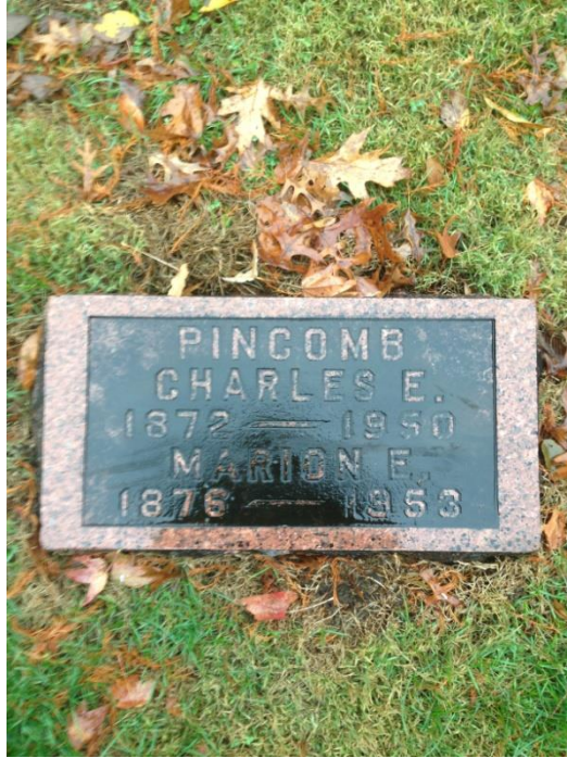
Figure 9: A modern photograph of the Charles Pincomb Tombstone. Located in the Corinth Cemetery, Prairie Village, Kansas.