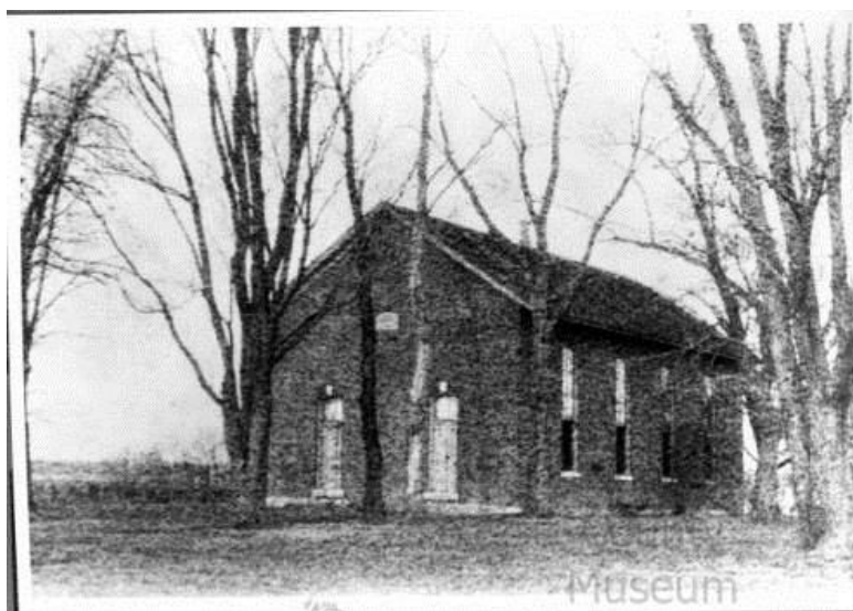
Figure 2: Cumberland Presbyterian Church circa 1890.

Another sign that the Hector area had a strong sense of community was that early on, the families established and built churches. Around 1868 or 1869, the Cumberland Presbyterian Church was established and the church was erected around the same time. 5