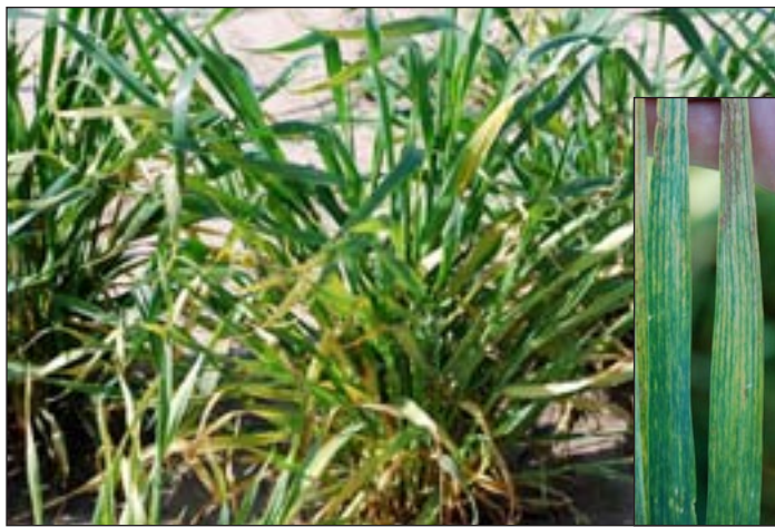
Figure 1. Symptoms of triticum mosaic include yellow streaking, spotting or mottling of leaves. These symptoms are very similar to those of wheat streak mosaic.

The variety RonL is known to be susceptible to triticum mosaic, but additional evaluation is needed before the reaction of other varieties can be determined. Preliminary evaluation suggests that some wheat varieties grown in Kansas are moderately resistant to infection by the virus. However, when plants are infected with both triticum mosaic and wheat streak mosaic, the symptoms may become much more severe (Figure 2). Plants that are infected with both diseases may die prematurely and produce little or no grain. This type of reaction also occurs when plants are infected with wheat streak mosaic and the high plains disease.