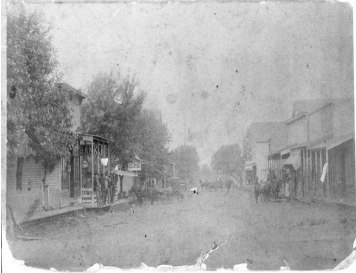
Figure 1: Looking north on Winchester St. between 2 nd and 3 rd streets, circa 1890s.