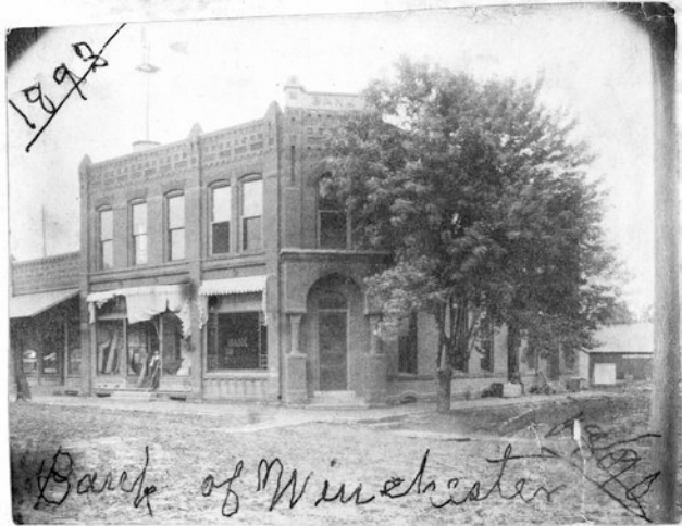
Figure 3: 1893 photo of the Bank in Winchester, KS.