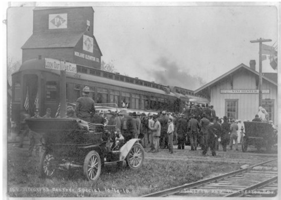
Figure 2: Political rally at the Union Pacific depot in Winchester, KS. Midland grain elevator visible in background. October 19, 1910.

By 1912, the town had stores, a hotel, bank, a weekly newspaper, and a post office serving the surrounding rural community. 2