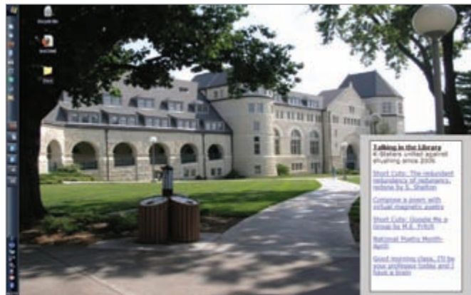
This is a library blog feed live on the desktop. Look mom, no browser!

All done! Your desktop now displays a happy feed showing your content. It will refresh itself automatically, and any new content will appear on your desktop within 20 minutes of being added to the feed. Some blog platforms publish a feed immediately, while others publish at regular intervals, so your mileage may vary a bit on the exact timing. When users click a link in the feed, it will open in a new browser window for them to read.