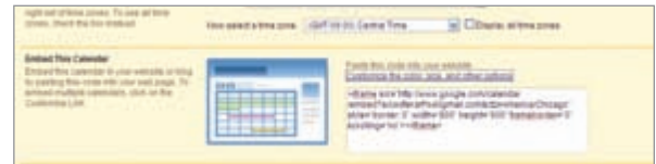
Setting up Google Calendar for use with Active Desktop

save as .html, and then follow the 10 setup steps just like you did for the feed. One of the benefits of going this route is that many applications have a step where you “style” your output, so you can pick the colors and fonts that work best for your needs without having to know how to write that kind of code.