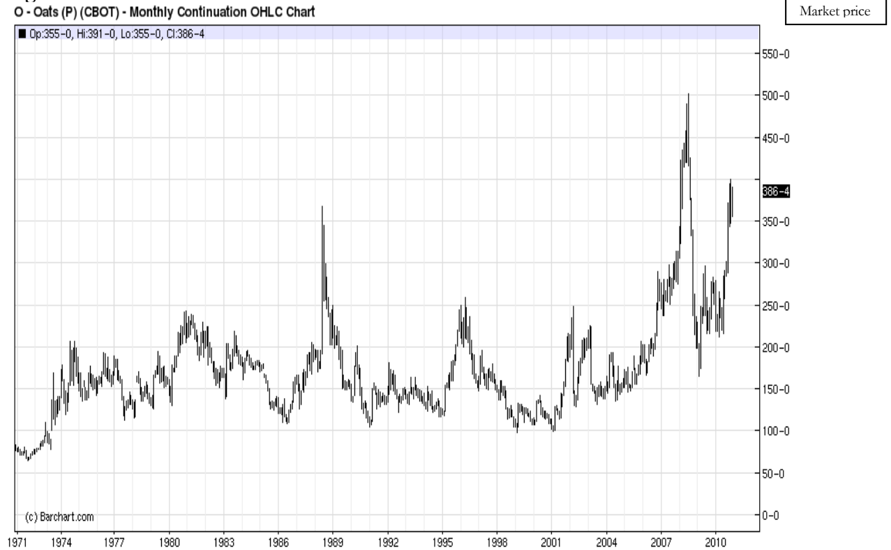
Figure 3.4 Oat Futures Historical Chart

Geographic and other influences provide data for the older facility analysis versus the new facility analysis. Gathering accurate data for each scenario is important for the accuracy of the net cash flow analysis. The older facility has additional costs included in the net cash flow calculation versus the new facility to provide accurate consideration of the financial influences when the facility is closed. The costs considered include salvage costs, relocation costs and closing costs when the decision is made to use a new facility. The costs are important due to their influence on total cost analysis in determination of net cash flow that is pertinent to the Net Present Value calculation.