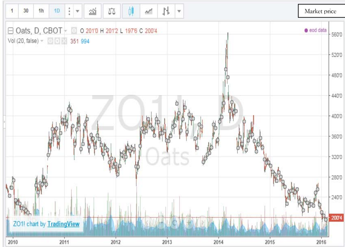
Figure 3.3 Oat Futures 6 Year Historical Chart

Source: http://ccstrade.com/historical/oats Capital Commodity Services, INC accessed 2/18/16