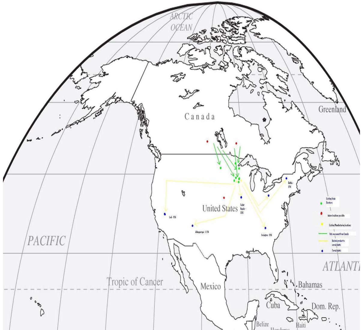
Figure 4.1: Product Flow Map