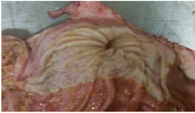
Figure 1. Esophageal opening of stomach with no keratinization or ulceration (keratinization score of 1 and ulcer score of 1 for an ulcer index score of 2). Keratinization and ulceration were scored by a single person at the time of slaughter from 4 pigs in each pen. Keratinization scores were assigned on a scale from 1 to 4 with 1 being normal or no keratinization of the esophageal region (as shown above), 2 being keratin covering <25% of the esophageal region, 3 being keratin covering 25 to 75% of the esophageal region, and 4 being keratin covering >75% of the esophageal region. Ulcer scores were also assigned on a scale from 1 to 4 with 1 being no ulcers present, 2 being ulceration affecting <25% of the esophageal region, 3 being ulceration affecting 25 to 75% of the esophageal region, and 4 being ulceration affecting >75% of the esophageal region. An index of stomach morphology was developed by adding a pig's ulcer and keratinization scores. An additional score of 4 was added to each pig that had an ulceration score greater than 1.