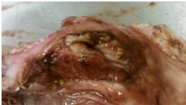
Figure 3. Esophageal opening of stomach with 100% ulceration (ulcer index score of 9). Keratinization and ulceration were scored by a single person at the time of slaughter from 4 pigs in each pen. Keratinization scores were assigned on a scale from 1 to 4 with 1 being normal or no keratinization of the esophageal region, 2 being keratin covering <25% of the esophageal region, 3 being keratin covering 25 to 75% of the esophageal region, and 4 being keratin covering >75% of the esophageal region (see above). Ulcer scores were also assigned on a scale from 1 to 4 with 1 being no ulcers present (see above), 2 being ulceration affecting <25% of the esophageal region, 3 being ulceration affecting 25 to 75% of the esophageal region, and 4 being ulceration affecting >75% of the esophageal region. An index of stomach morphology was developed by adding a pig's ulcer and keratinization scores. An additional score of 4 was added to each pig that had an ulceration score greater than 1.

worse stomach morphology, as ulceration is a product of keratinization and represents a stomach with a more progressed case of esophageal deterioration. Therefore, this index was developed so that a high score represents a stomach with more damage present from keratinization and ulceration. Before final marketing, all pigs were individually weighed and tattooed for carcass data collection. On d 112 (barrows) and 118 (gilts) of the trial, all remaining pigs were transported 246 km to a commercial packing plant (Tyson Foods, Waterloo, IA) for harvest. Standard carcass characteristics including HCW, carcass yield (calculated from HCW and farm weight), and percentage lean (lean % = 48.3575 - (6.38916 \times \text{backfat, mm}) + (4.424677 \times \text{loin depth, mm}) ) were measured and calculated using National Pork Producers Council (2001) procedures. Fat depth and loin depth were measured with an optical probe (SFK Technology, Herlev, Denmark) inserted between the third and fourth ribs of the right side of the carcass located anterior to the last rib at a distance approximately 7 cm from the dorsal midline.