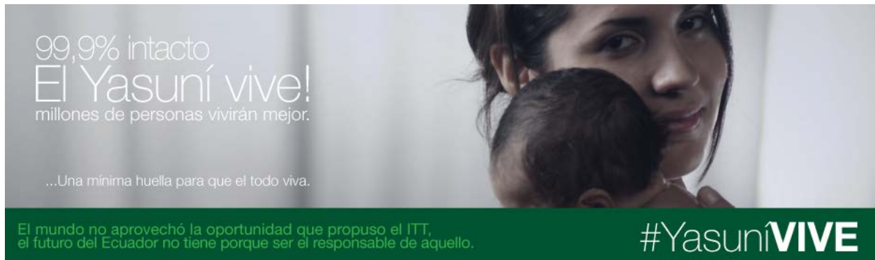
Figure 3.5 Government messaging after initiative cancellation: “99.9% intact, the Yasuní lives! Millions of people will live better...A small footprint such that all may live...The world didn’t seize the opportunity put forward by the ITT, and the future of Ecuador can’t be held responsible for that” (Yasuní-ITT inicio, 2013, author’s translation).