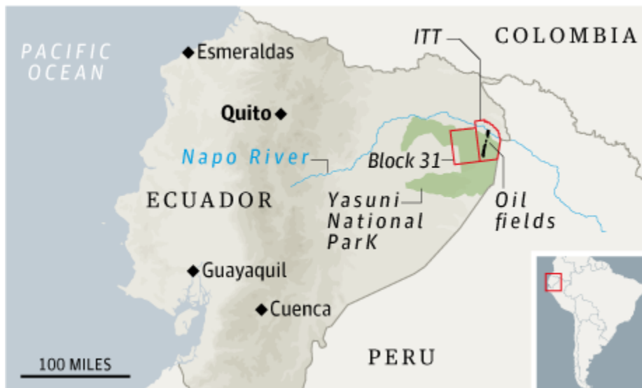
Figure 3.2 The Yasuní-ITT within Ecuador. From Hill (2014).

2013, p. 86). First explored by state company Petroecuador in 1992, the presence of these reserves has raised the spectre of further destruction of dwindling Amazonian forests, and forced Ecuador and the world to grapple with competing conservation, climate change mitigation, and economic development values in determining their fate (for a discussion of natural capital and services valuation challenges within economic decision making in the Yasuní-ITT context, see Rival, 2009).