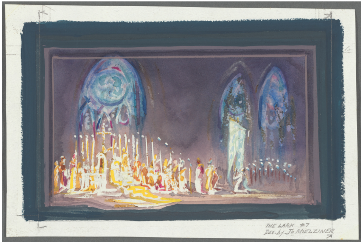
Figure 1.3: Jo Mielziner’s Scenic Design for the Coronation Scene, The Lark , Act II 93

Credit must also be given to the play’s director, Joseph Anthony, who persevered despite Hellman’s micromanagement and interference during rehearsals, 91 as well as to the exceptional scenic and lighting designs of Jo Mielziner, whose work was rightly praised by reviewers. Stunning drawings of Mielziner’s concepts may be found in the Jules Fisher collection of Jo Mielziner designs at the New York Public Library (for a sample, see Figure 1.3 below). 92 On the matter of credit owed, we may now return at last to our principal subject: Leonard Bernstein, and his own contribution to the success of Hellman’s Lark .