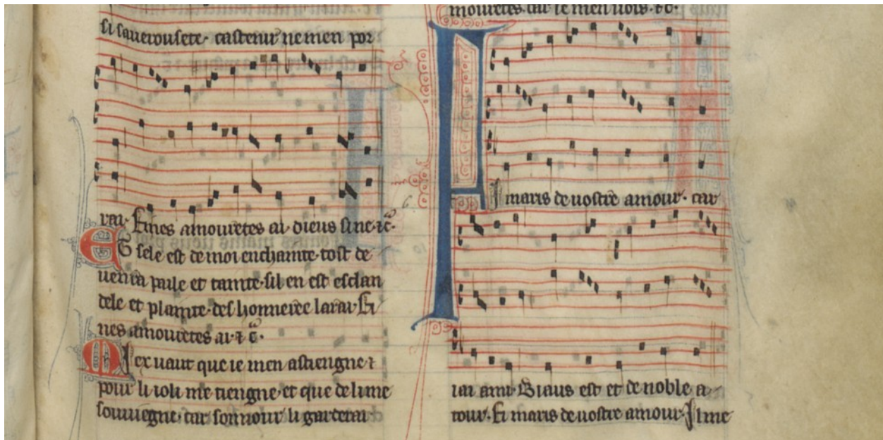
Figure 2.6: Detail, Adam de la Halle, rondeau, “Fi, mari, de vos tre amour,” (right side), F-Pn fr. 25566, f. 33r

At first is difficult to know what to make of Bernstein’s variant of the text, which does not directly correspond to any historical source. However, the matter is somewhat clarified by a leaf in Bernstein’s sketches, in which he wrote out the text for the Court Song separately from its music, in a slightly different form than was used in the completed chorus. 174 Comparing these variants side by side (see Table 2.6 below), we can see evidence of gradual corruption in the text in the process of successive transcriptions (e.g. “Car” to “Cor,” “atour” to “a tour,” “Il me sert et nuit” to “Ne sert de nuit,” etc. ).