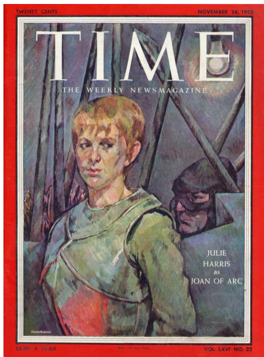
Figure 1.1: November 28, 1955 Cover of Time Magazine 75

Despite such grouching, Hellman’s Lark was incredibly successful, running for 229 performances to close on June 2, 1956. Within a fortnight of the opening of The Lark , Julie Harris, whose performance had been lauded by the critics, was featured on the cover of Time Magazine 72 in an illustration costumed as Joan (see Figure 1.1 below), along with an accompanying profile article. 73 A scene from the production was later memorialized in a cartoon by the famed caricaturist Alfred Frueh in the New Yorker (see Figure 1.2 below). 74