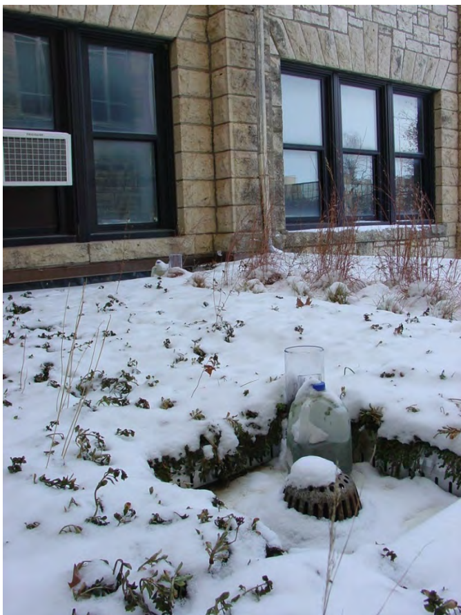
Jan. 1, 2013. Monitoring snowfall in two locations.