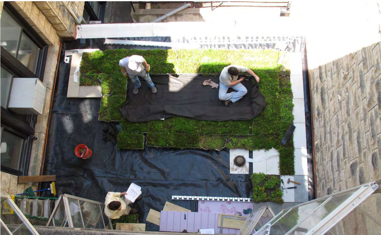
May 8, 2012 during installation of filter fabric (which lies beneath the integrated soil system).