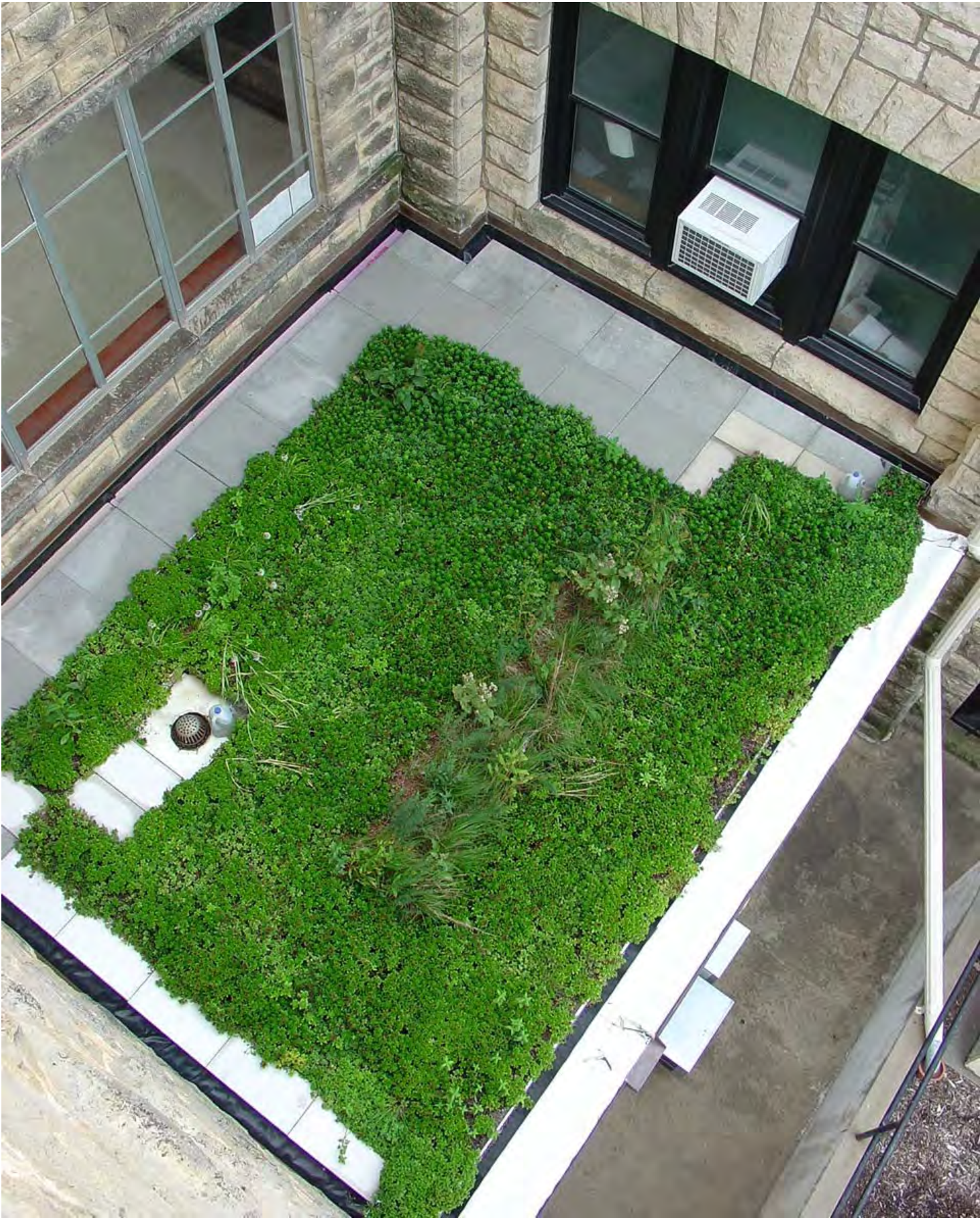
August 5, 2013 amid the second full growing season on the lower green roof. Note that supplemental irrigation (by hand-held hose) is being provided on an “as need” basis (in other words, when soils are dry and vegetation is stressed).