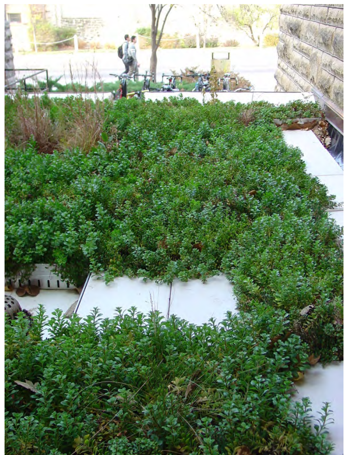
Photo by Lee R. Skabelund – Nov. 9, 2012. Pavers, drain, sedum trays & native plants (going dormant).