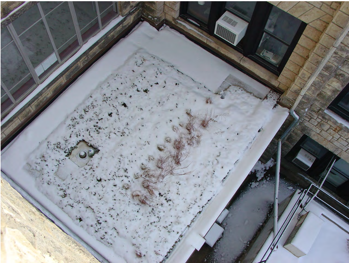
Photo by Lee R. Skabelund – Jan. 1, 2013, following Dec. 31, 2012 snowstorm.