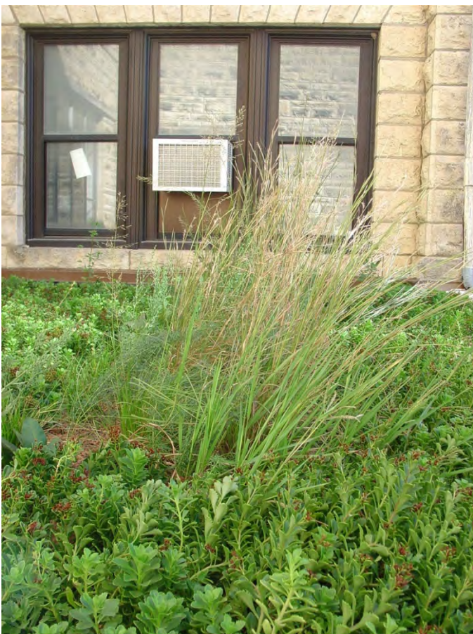
Photo by Lee R. Skabelund – Sep. 22, 2012. Native plants in integrated area.