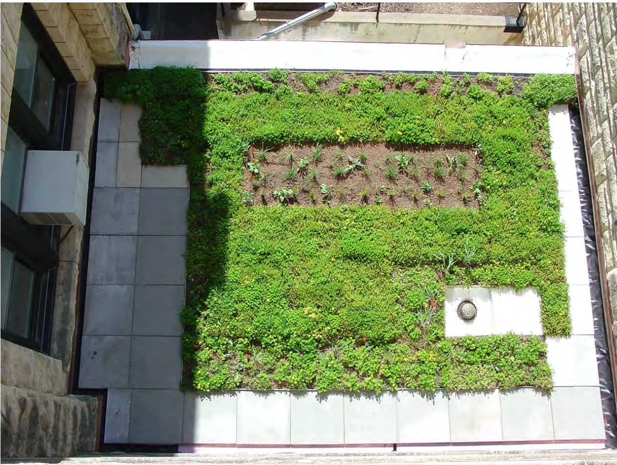
May 16, 2012 following completion of prairie species planting within the integrated area.