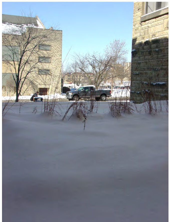
Feb. 22, 2013. 6-8 inches of snow and 0.70-0.80 inches of precipitation.