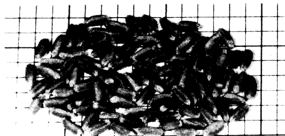
HARD WHITE WINTER