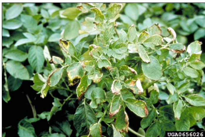
Figure 1. Symptoms of Bacterial Ring Rot on a potato plant: advanced stage of infection, showing wilt, rolling of leaf margins, mottling and necrotic tissue.

For more information contact Megan Kennelly, Extension Plant Pathologist, Kansas State University, at kennelly@ksu.edu