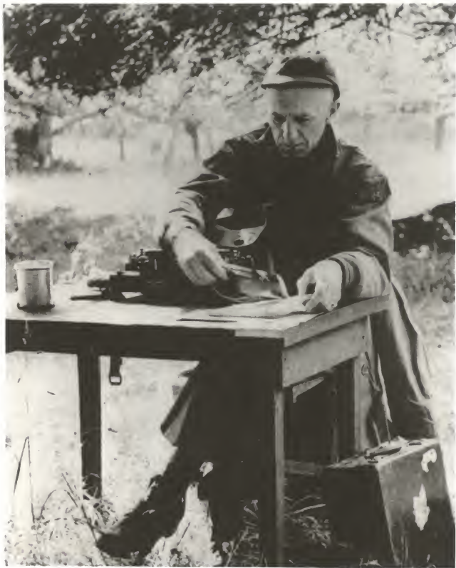
From An Ernie Pyle Album