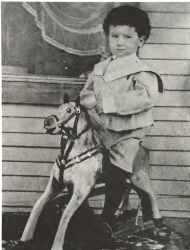
From An Ernie Pyle Album