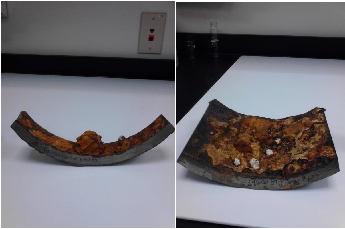
Samples of the Cast Iron Pipes taken from Fort Riley's Water Main. 2013

The Environmental Health Department is also responsible for conducting quarterly inspections of Irwin Army Community Hospitals different departments to insure proper waste management is being followed; we conducted an inspection of the hospital pharmacy. We insured the proper waist bins (sharps, biowaste, medication, and cytotoxic) were in their proper locations and not full. This was the first time I have learned about the special handling required for cytotoxic (cancer) drugs. The handling of cytotoxic drugs is generally only done by the male staff, since there is a high risk involved to females who may be pregnant.