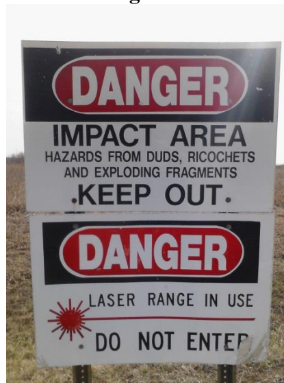
Warning Sign (2013)

Outlying the warning signs is a “hard-ball” (paved) road that encircles the impact area and outlying the hard-ball road is the “tank trail”. As the name suggests this is a gravel road that is used by tanks and other heavy military vehicles that could damage the hard-ball road. The weapons ranges for Fort Riley are on the outlying border of the impact area with all the weapons being fired towards the center. Weapon calibers such as: 9mm, 5.56, .50, and 7.62, greatly vary