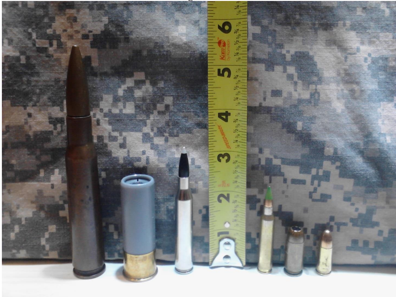
From left to right: .50, 12 Gauge, 7.62, 5.56 (green tip), .45 (hollow point), and 9 mm. 2013