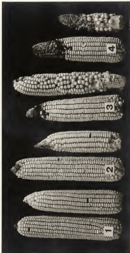
Fig. 1. Class of Injury.