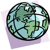
Figure A.1 First Figure in Appendix A

To make this change, the codes in the caption labels must be modified, and it’s best to wait until all figures and tables have been added to appendices. For details, see the Appendices section on the Using Word page ( http://www.k-state.edu/grad/etdr/orient/wordindex.htm ).