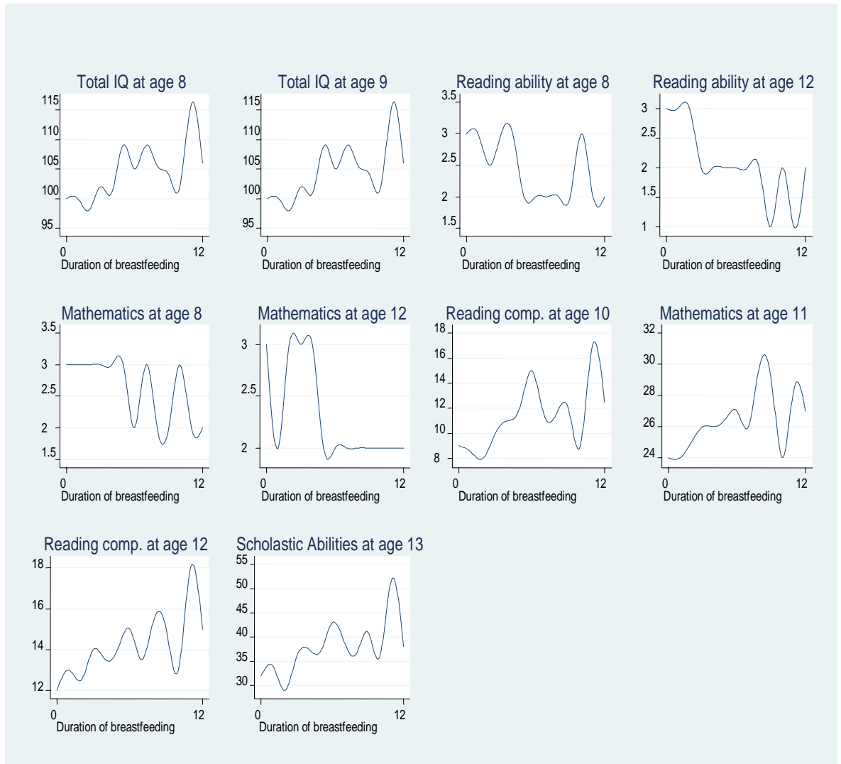
Figure 1.1 Unadjusted Relationship between Breastfeeding and Scholastic Achievement