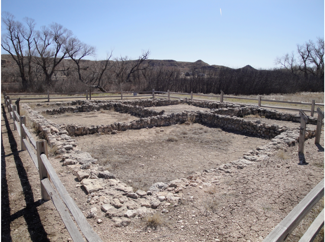
Attachment 3: El Quarteletejo ruins today, in dire need of conservation and protection.