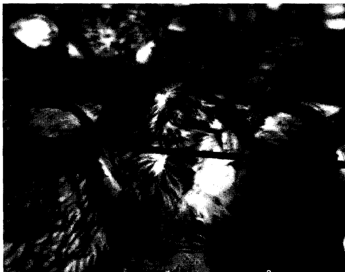
Figure 2. Thermal Image of Feedlot Heifers Taken in Pen. Heifer in Foreground Has a Functional Implant in Right Ear (4.0°F Warmer than Right Ear). Heifer in Background Has an Abscessed Implant in Left Ear (17.7°F Warmer than Left Ear). (Black=cold, White=hot).