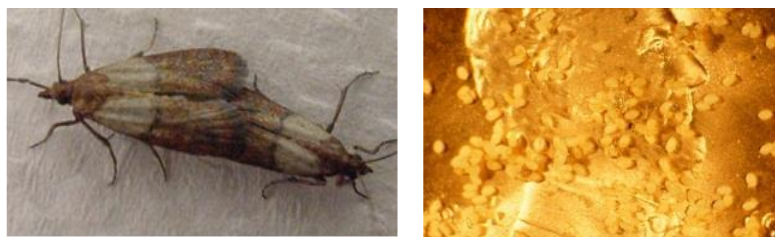
Fig. 1, left, Adult IMM in copula; Fig. 2, IMM eggs

Indian Meal Moth (IMM), Plodia interpunctella , is a pest of stored grains, value-added grain products like pet foods and also in consumer households. It is commonly found in stored products due to that being its main source of food. IMM can get into spices, animal foods, grains, dried fruit and seeds. A female can lay up to 400 eggs in her short lifetime. Eggs are laid near a good food source presumably so larvae do not have to go far (Sambaraju et al. 2016). The most harmful things about the IMM is their ability to get into stored products and damage them by not only eating them, but also spinning their web as larvae (Figs. 1 and 2).