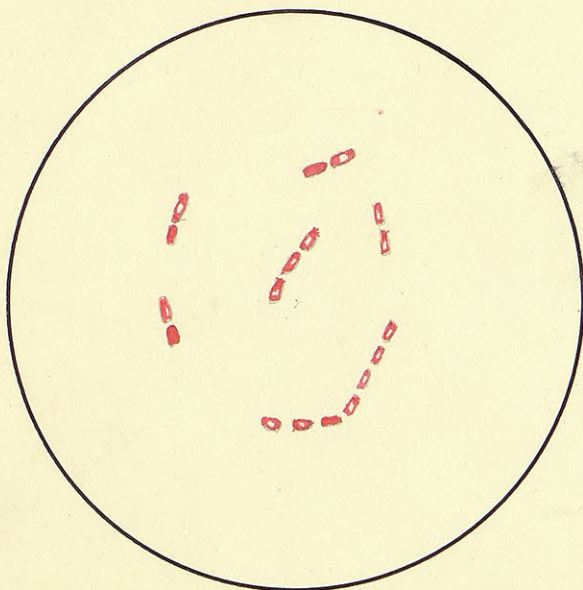
Nos. 1 and 3 Not identified.