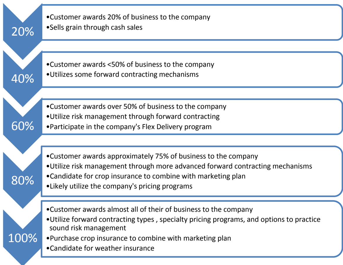
Figure 7.2 Customer Relationship Growth Trend

grow and move customers along the trend will receive incentive for further developing relationships and growing the business. Each level will establish a different level of compensation to incent employees towards the pattern of growth and expanding existing and new customer relationships.