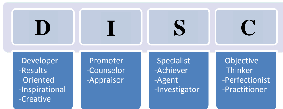
Figure 7.1 DISC Profile Assessments

The personality assessment will be required to be completed by all employees. The structure of each office can take shape based upon the personality types of the employees to best match the personality of the customers that they are serving. This opportunity will need further analysis into the market segments to understand the behavioral patterns and the composition of personalities with employees in our organization.