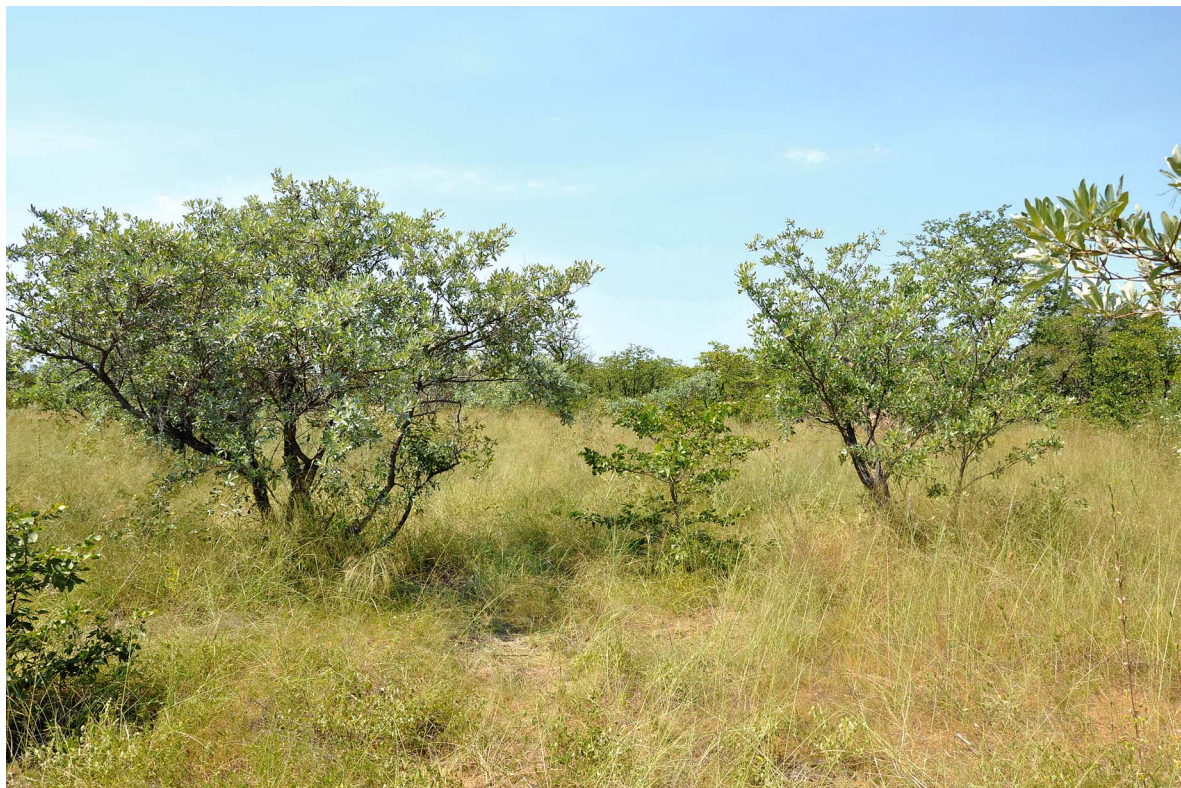
PLATE 1. Representative Terminalia sericea -dominated lowveld savanna in Kruger National Park, South Africa.

the continuous automated measurement of the temperature of wet leaves, T_w . As with tree sap flow, our aim was to capture an index of relative change in water use across the growing season rather than absolute values of moisture stress (the usual application of CWSI for irrigation timing). Both T_c and \Delta T have been shown to be suitable indices of plant water status (Cohen et al. 2005, Ben-Gal et al. 2009, Stefan et al. 2014). Since these metrics vary inversely with water use, we used -T_c and -\Delta T as response variables in our statistical analysis to make the signs of our regression coefficients comparable across trees and grasses.