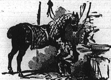
Dr. W. S. Riley's Alternative Renovating Powders.

ANSWER.—You have a case of capped hock, the result of an injury, and we do not propose to tell you to remove the cause in order to effect a cure, because it will not do it. This condition is usually brought about by the animal kicking against the sides of the stall, and so long as he adheres to this habit just so long will he keep up the unsightly enlargement. There is no doubt but the sac is full of fluid, and it will be necessary to make an opening in order to get rid of it; after it has been emptied, inject the sac once a day with one part of tincture of iodine to four of water; it should not remain in longer than five or ten minutes, when it may be pressed out. About four injections will produce the desired effect. Externally, clip the hair from the swollen parts, and apply the following every alternate day, till the parts become sore, when it may be discontinued for a few days: Take iodine resub and iodide of potassium, of each one to lard twelve parts; mix, and apply with friction. Absorption of the enlargement is always slow in such cases, but if persevered in will eventually overcome the difficulty and restore the parts to a normal condition.—Turf, Field and Farm.