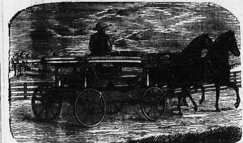
AULTMAN & TAYLOR HORSE POWER.

No Horse Power has given such satisfaction as has