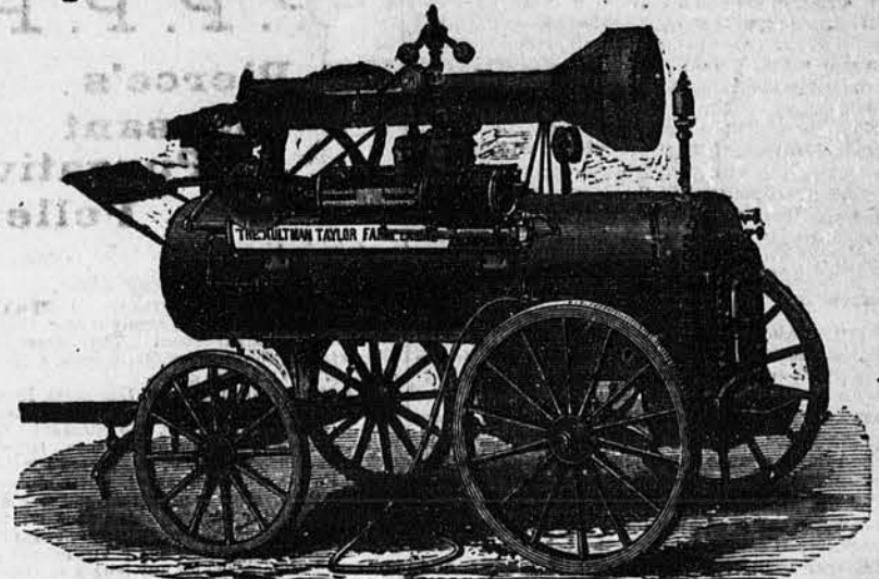
AULTMAN & TAYLOR FARM ENGINE.