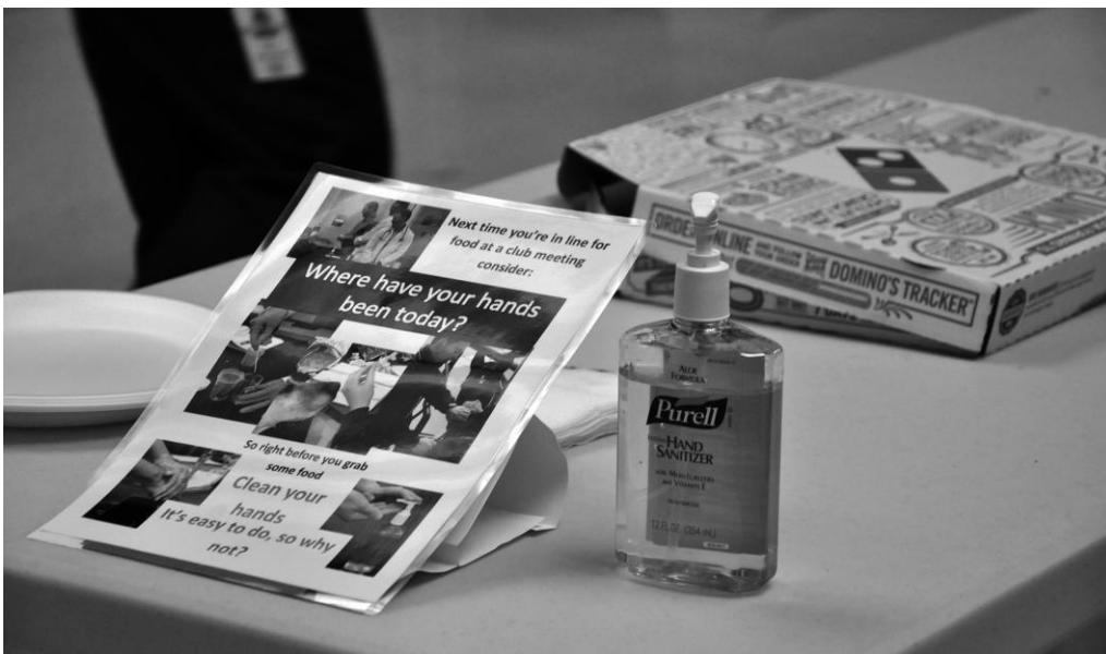
Figure 2.1 Poster next to hand sanitizer displayed at veterinary student organization meetings during post-intervention observations.