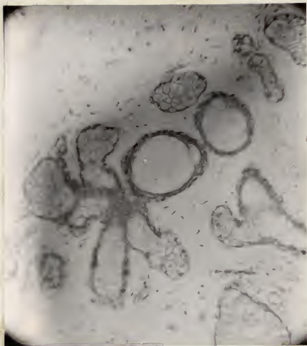
Fig. 2. Section of the conjunctiva of rabbit affected with purulent conjunctivitis.