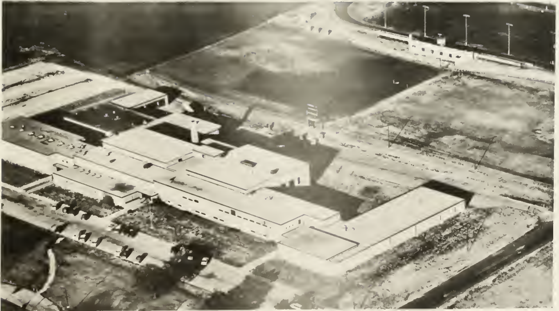
Highland Park High School Building with Additions 1951-1956