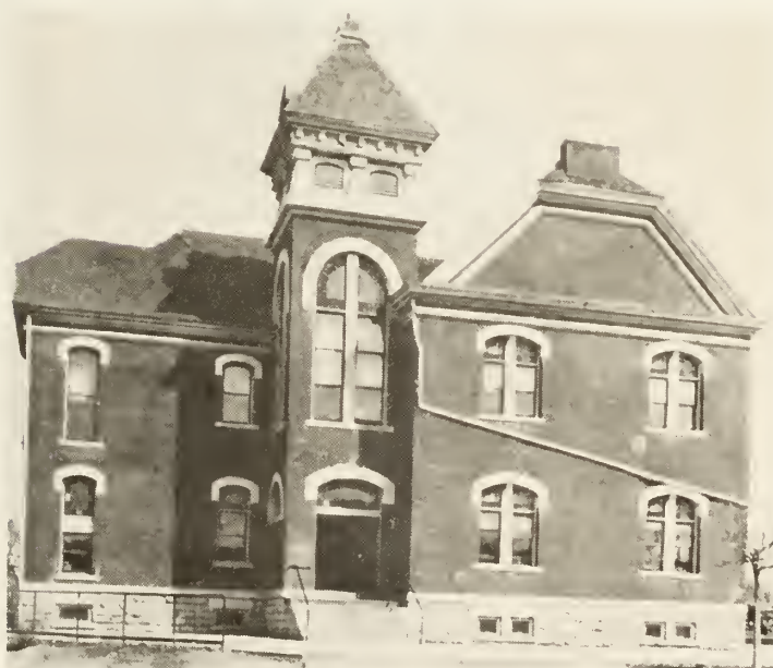
Highland Park School, 1889