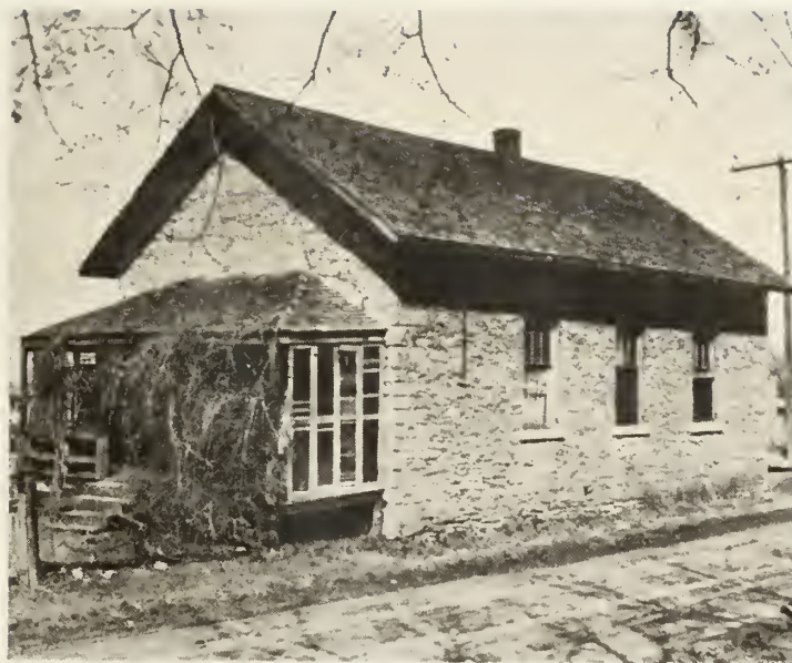
First Highland Park School, 1868