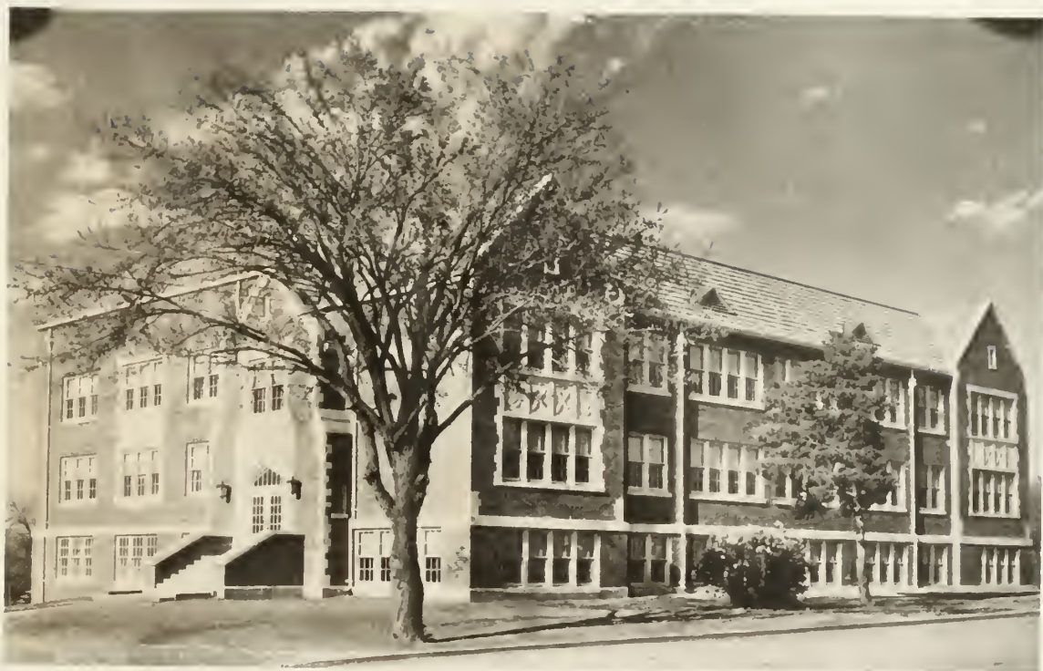
Highland Park High School, 1935