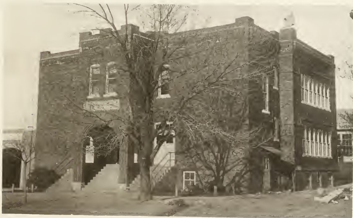
First High School Building, 1916