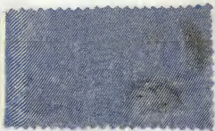
Blue Cotton Stretch Denim