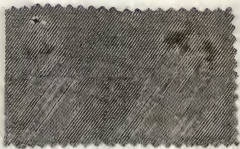
Gray Cotton Stretch Denim