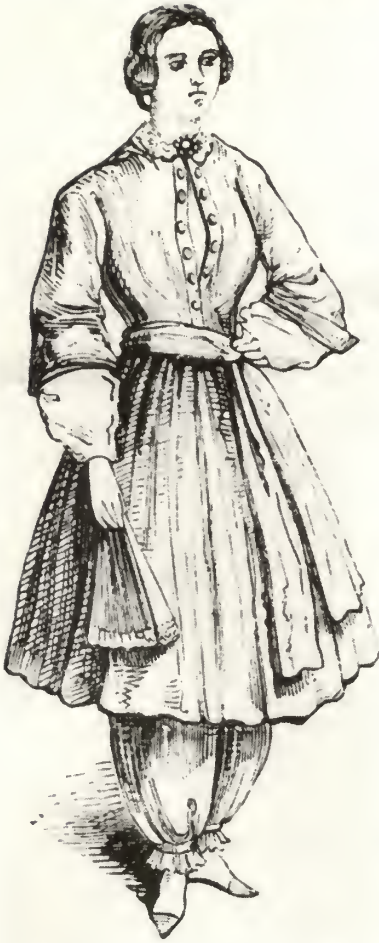
Mrs. Bloomer wearing the dress she tried to introduce in 1849.