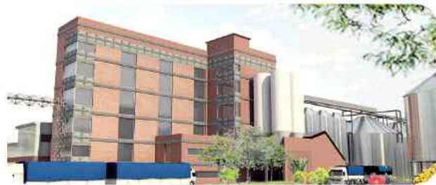
EMILIO LUQUE Tucuman (Argentina) Hard wheat milling plant of 300 tons / 24h Silos for feeding pasta

MILL SERVICE SPA Via Pelosa, 78 Selvazzano Dentro, Padova / Italia Ph. +39 049 8978743 + 39 049 8978744 Fax +39 049 8978780 info@ms-italia.com - www.ms-italia.com