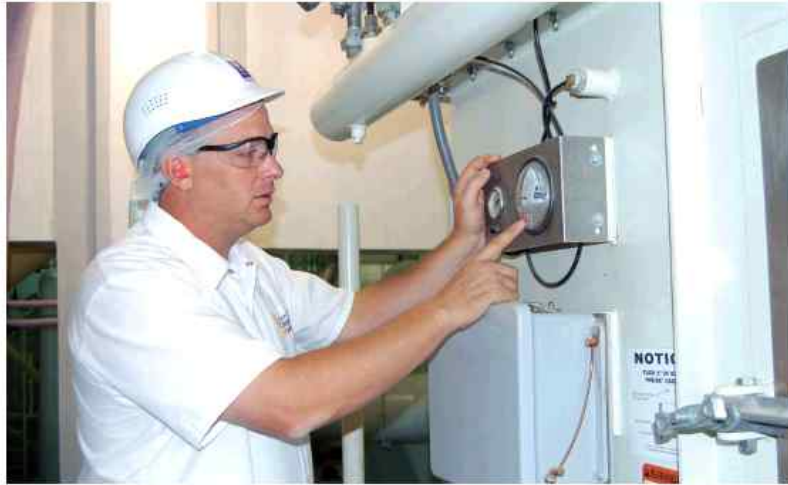
Objective interval maintenance is based on monitoring operating conditions of equipment and planning maintenance based on pre-determined targets.

an opportunity for significant cost savings. Identifying wrong or obsolete parts and getting them out of inventory reduces time and space requirements needed to store and maintain the parts inventory.