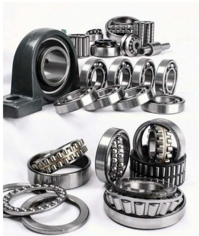
All rotating shafts must be supported by some type of bearing.

A radial bearing can simply be a hole bored in a block of