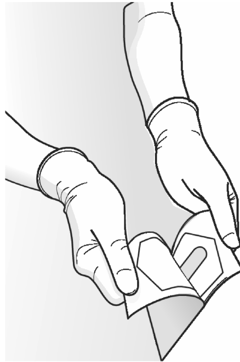
Figure 1. Typical opening approach of a medical device contained in a Chevron Pouch (Adapted from Bix and de la Fuente.

The specific goal of this research was to assess the impact of a single packaging design factor, specifically pouch size in flexible peel packs, on rates of contact between package contents and the outside of the pouch or gloves of the circulator (both of which are considered non-sterile) during aseptic presentation to a simulated sterile field. (See Figure 1).