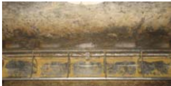
Figure 2. Example of pan coverage for feeder setting 5.