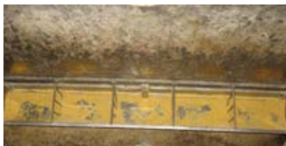
Figure 4. Example of pan coverage for feeder setting 1.