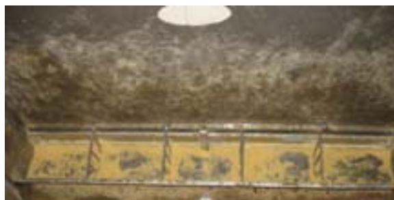
Figure 3. Example of pan coverage for feeder setting 3.