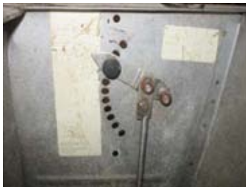
Figure 1. Example of STACO stainless steel dry feeder on feeder setting 3.

trough to the bottom of the feed plate when the feed plate was in the high position was approximately 1.15 in. The amount of feed covering the bottom surface of the feeder pan for this setting averaged 61%. However, the range for individual feeders on this adjustment setting was large with a range of 14 to 93%. On the basis of this data, our recommendation is for feeders to be adjusted to allow feed to cover slightly more than half of the feed pan without feed accumulating in the corners.