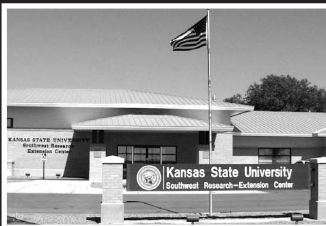
Southwest Research-Extension Center