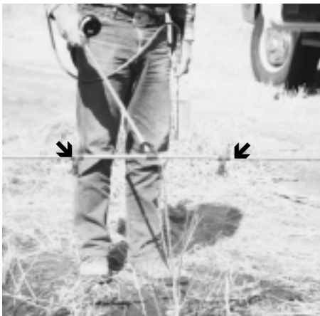
Figure 1. Spray rig used to apply herbicides over the seedlings. The nozzle positions allowed application to the side of seedlings.

Control of both broadleaf and grassy weeds is necessary for successful establishment and growth of tree plantings in the Great Plains region. Imazaquin alone may not control grasses sufficiently and needs to be combined with another herbicide, especially in the absence of adequate early spring precipitation. Pendimethalin alone and in combination with imazaquin, as applied in this study, can be used for controlling weeds with little damage noted 90 days after treatment to the woody plants tested. About 88% had slight damage or no damage, and 7% had slight damage, with slight reddening of silver maple and some brown leaves on arborvitae. Only one of the four Populus clones tested, P-26, and golden currant, showed any substantive reduction in height, and survival was good for all species. These results show that any of the four pendimethalin treatments applied during the dormant season on the 15 clones/species of woody plants studied were effective in controlling weeds while causing little or no damage to the plants.