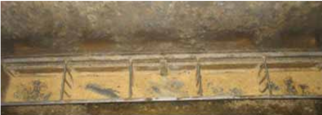
Figure 2. Conventional dry feeder with pelleted diets averaging 61% feeder pan coverage, Exp. 2.