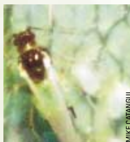
Figure 3. A winged adult soybean aphid that migrated from soybean to buckthorn in the fall. The two young aphids to the right will eventually lay the eggs that will overwinter on the twigs.