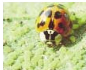
Figure 10. An Asian lady beetle feeding on soybean aphids.