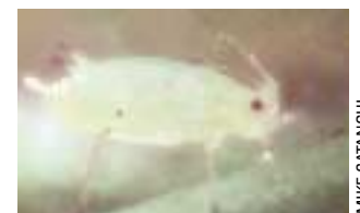
Figure 4. A wingless soybean aphid on a buckthorn leaf in the spring.