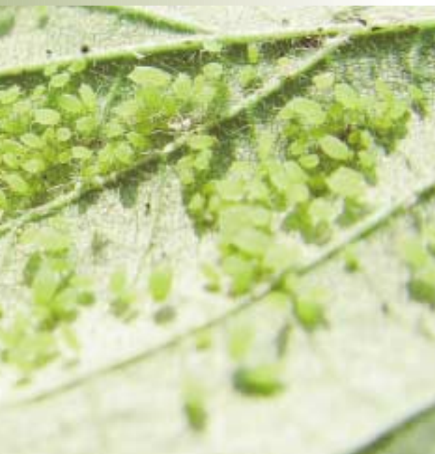
Figure 8. Colony of aphids on the underside of a soybean leaf.

Soybean aphids can be found mainly on the young leaves and stems of the soybean plants early in the season (Figs. 6-7). As the plants mature, the aphids tend to be found mainly underneath the lower leaves (Fig. 8) and on the developing pods.