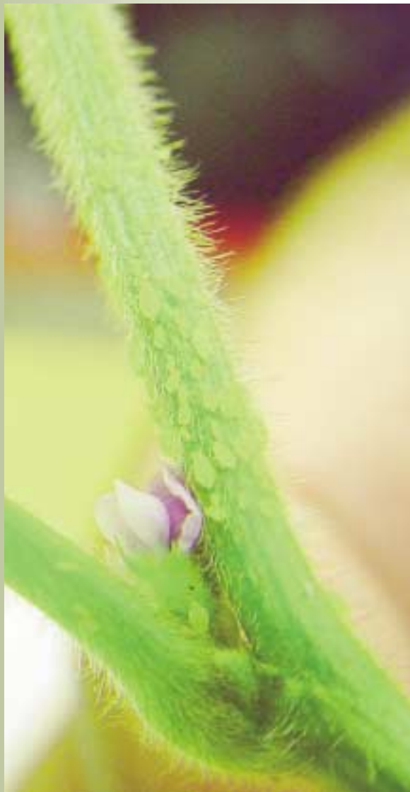
Figure 7. Colony of soybean aphids on soybean stem and flower.