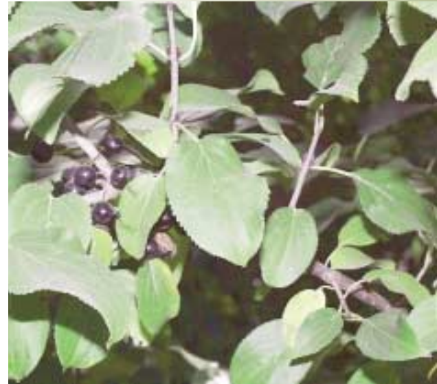
Figure 5. Common buckthorn ( Rhamnus cathartica ) showing leaves, berries, twigs, and thorn in early fall in South Dakota.

Scouting for soybean aphids should start as soon as the soybean plants produce two trifoliate leaves (V2) and be continued until the beginning seed (R5) stage of soybean development.