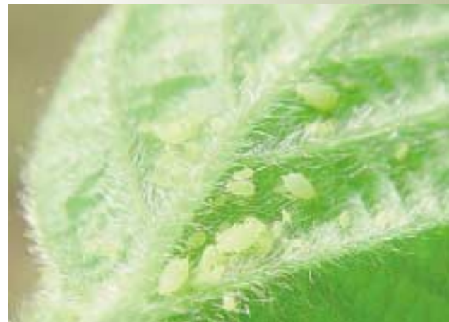
Figure 6. Colony of soybean aphids on a newly-unfurled soybean leaf.