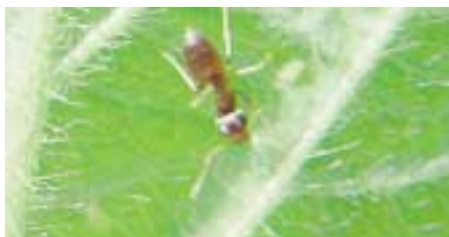
Figure 9. An ant tending a soybean aphid.

Because the soybean aphid is a new pest of South Dakota soybeans, there are still many variables that need to be investigated before we can fully understand the injuries that these insects cause at any given time or plant stage. Some of these variables are soybean variety, plant population, row spacing, and location in the state. Eventually, soybean aphid management will need to be adjusted for the diverse soybean growing conditions in South Dakota.