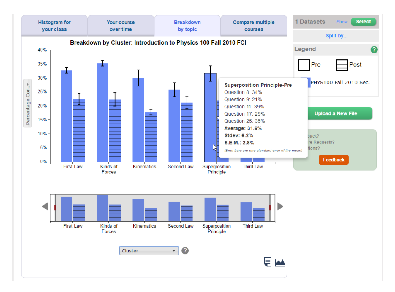
Figure 5. Visualization of student performance on pre- and post- assessment, organized by classification of question. Class labels are assigned by subject matter experts (physics education researchers).