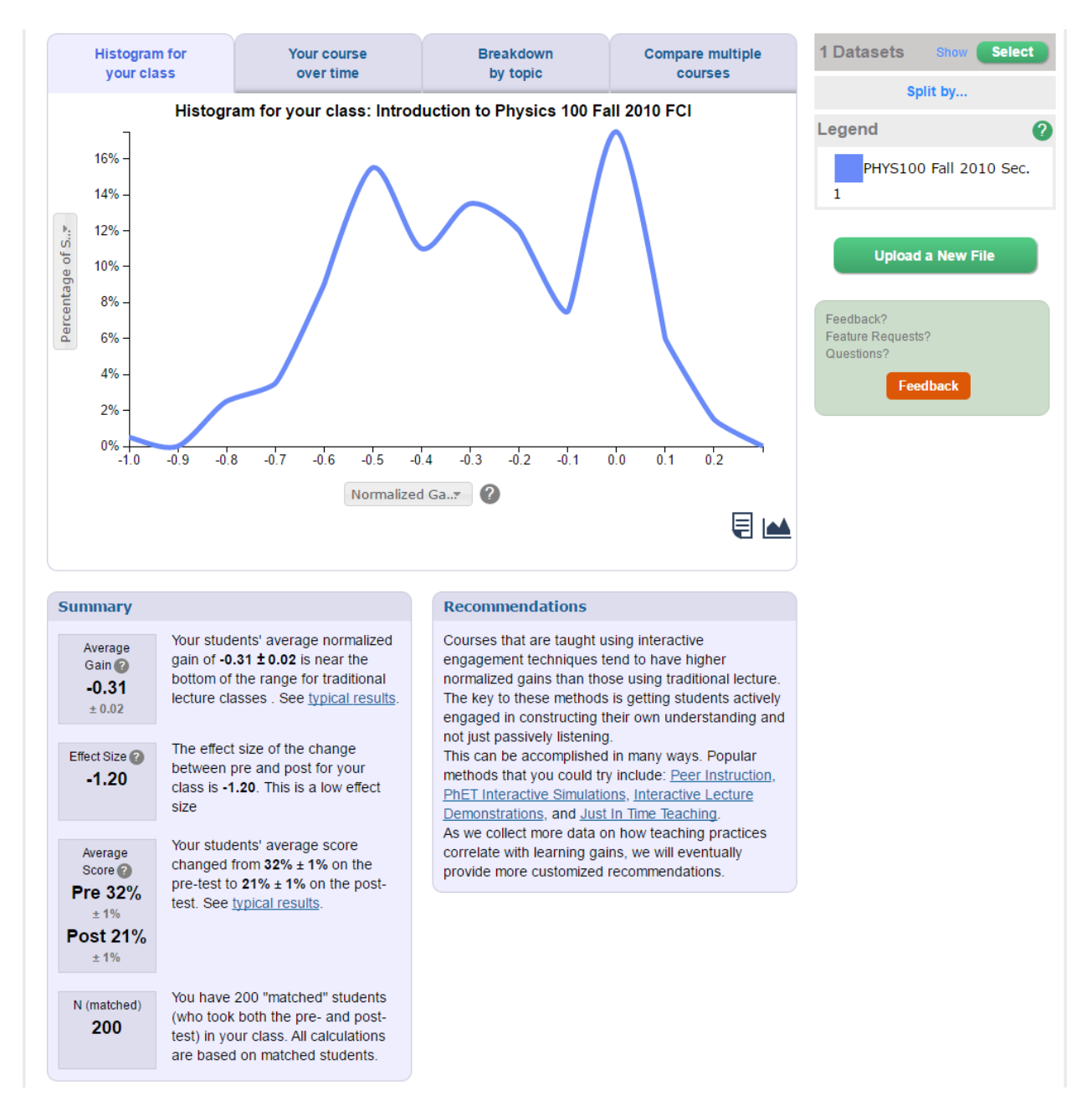
Figure 3. Data visualizer component of the Data Explorer, displaying a histogram of normalized gain for a hypothetical class on the Force Concept Inventory (FCI) assessment.