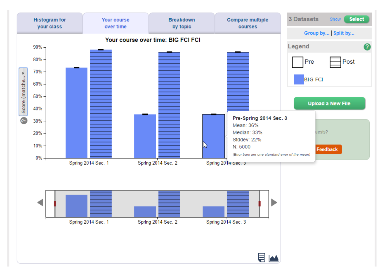
Figure 6. Visualization of courses over time: tracking performance across classes in multiple offerings (semesters and sections) in a longitudinal study.