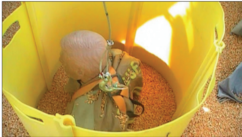
Figure 2. Grain rescue tube in place around simulated victim.