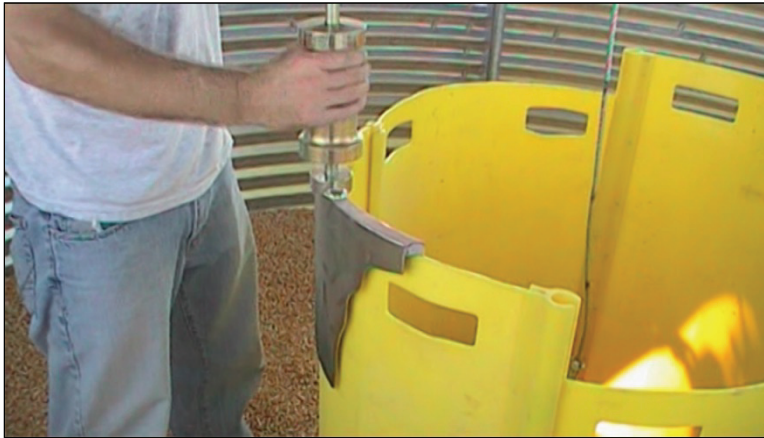
Figure 4. Grain rescue tube panels being driven further into the grain mass with the panel driver.