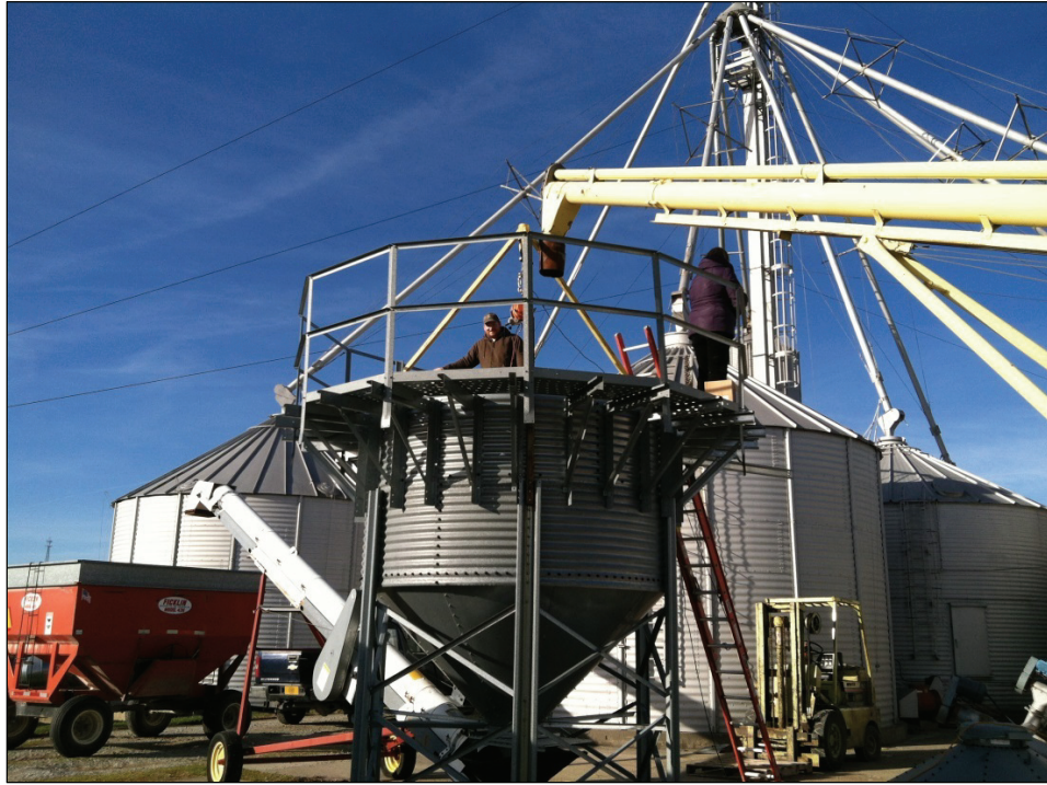
Figure 1. Photo of test facility used to measure vertical pull force.

1.83 m (6 ft) tall rescue mannequin dressed in firefighter bib overalls and jacket. A full-body, ANSI-rated safety harness with a back-mounted D-ring was placed on the mannequin and served as the point of attachment for the winch cable (fig. 2).