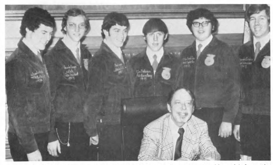
During the 1975 Good-Will Tour, the State Officers had a very enjoyable and informative visit with Governor Robert Bennett. Governor Bennett will be at the State FFA Convention to present the "Governor's Citation" to the top BOAC chapter in Kansas.