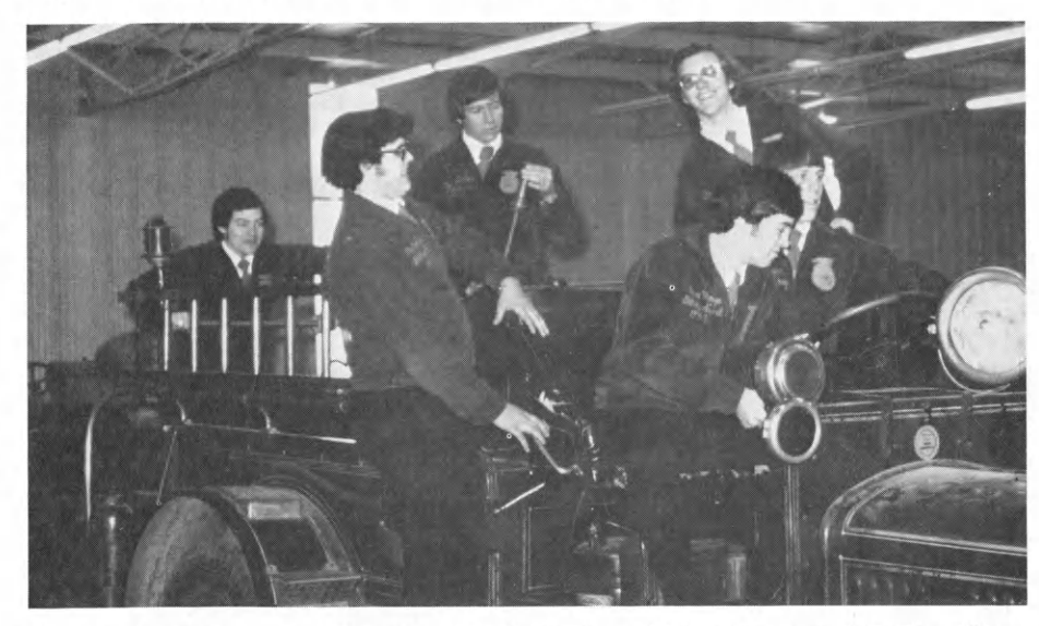
The Good-Will Tour included a stop at the Agricultural Hall of Fame at which the officers tried their hand in fire engine operation.