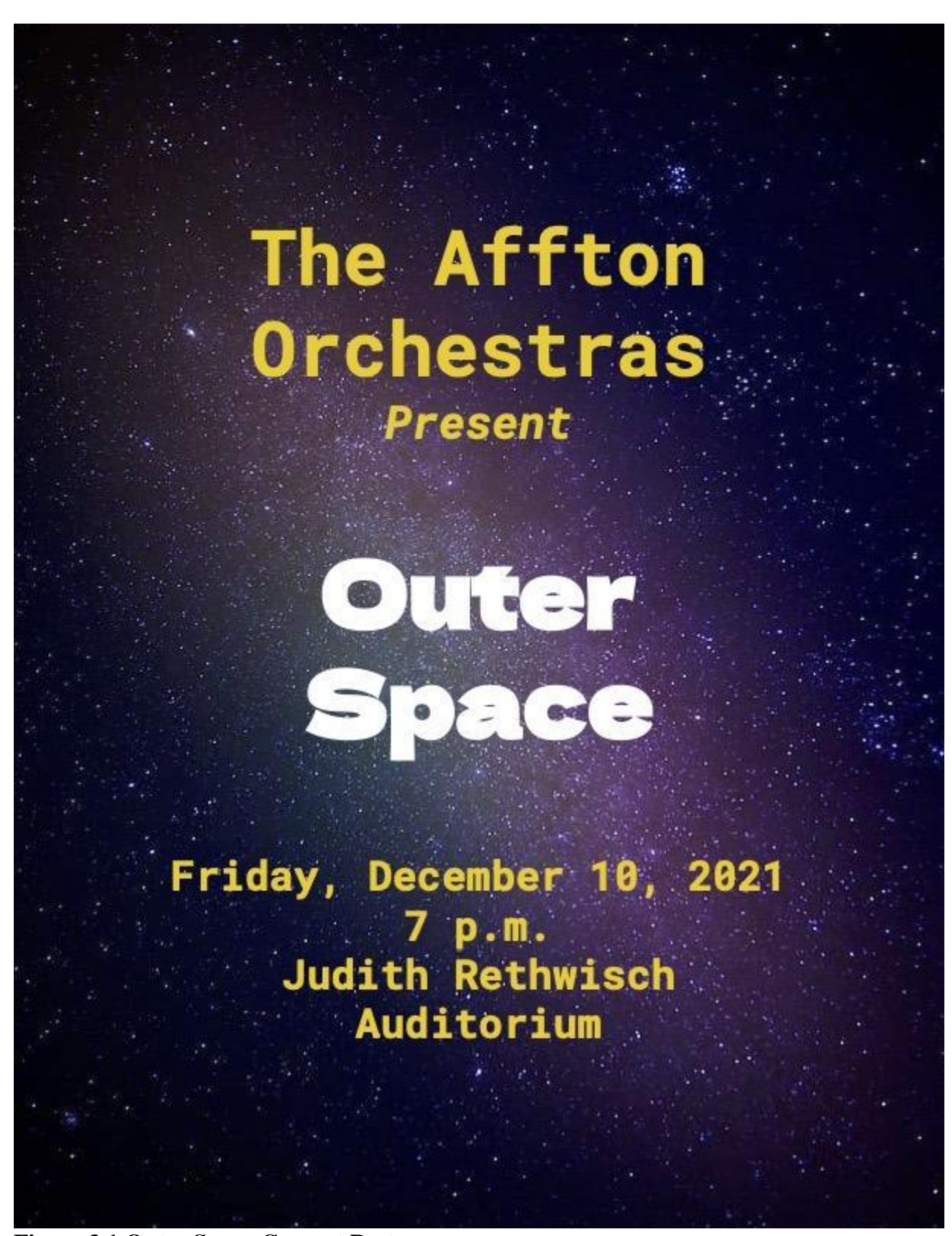
Figure 3.1 Outer Space Concert Poster