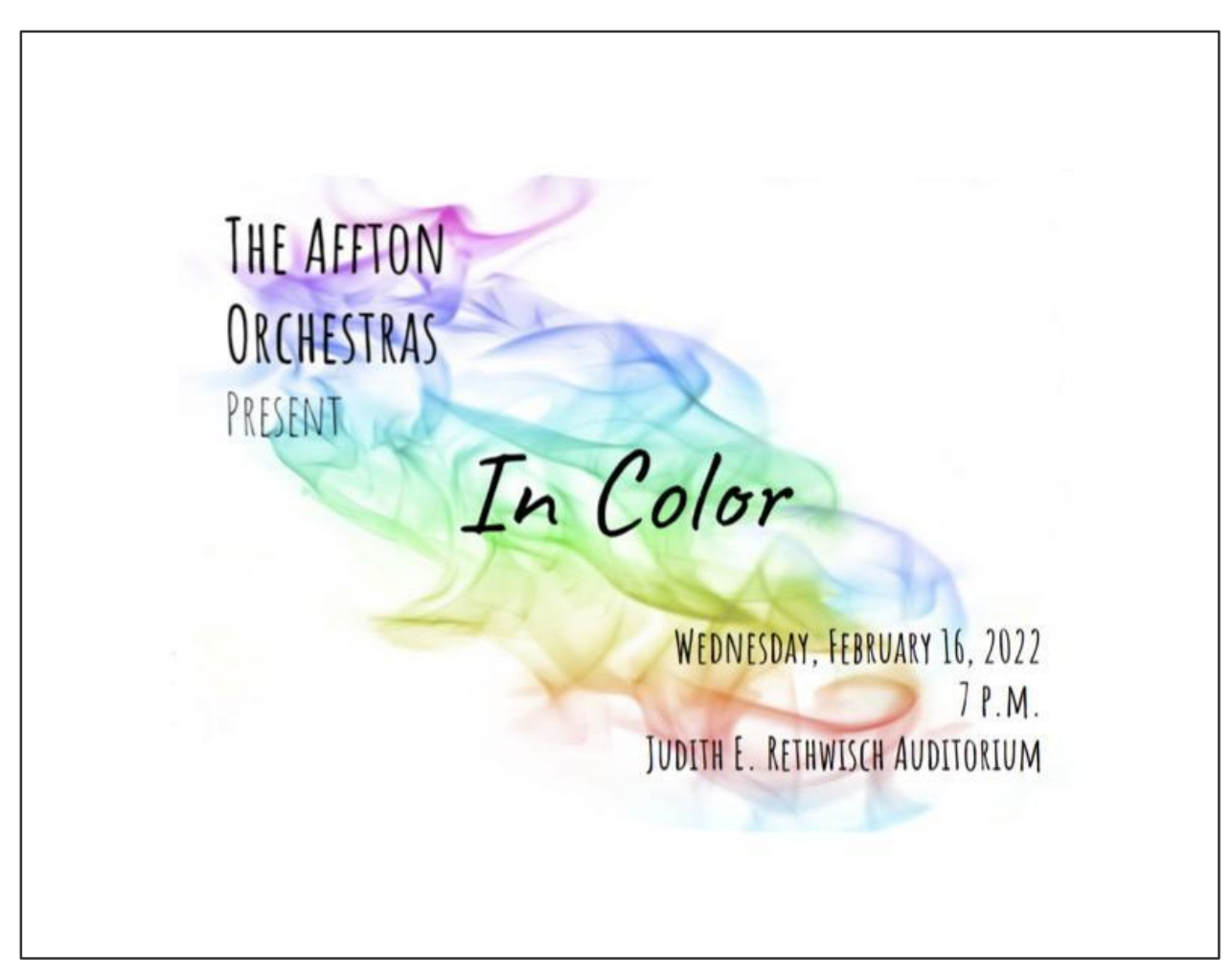
Figure 3.2 In Color Concert Poster