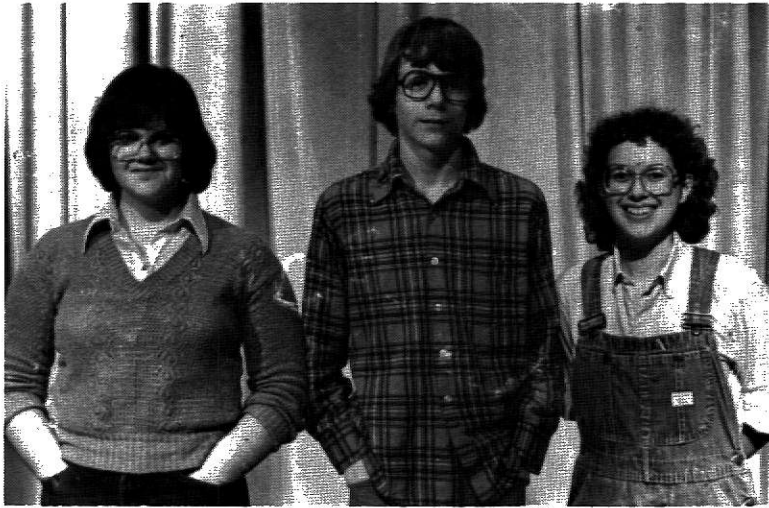
THE PRODUCTION STAFF IN PICTURES