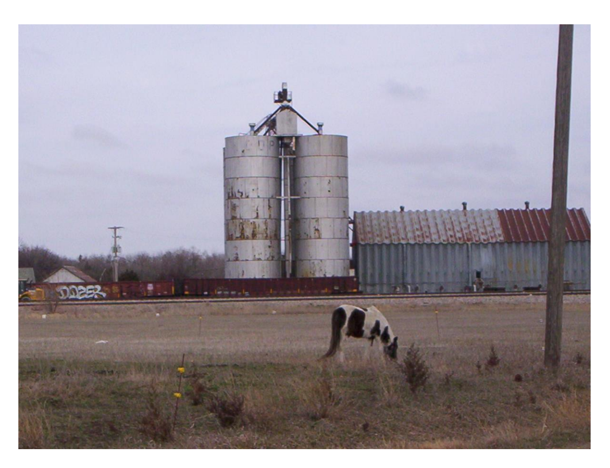
Figure 6: A photograph of the Ramona Grain elevator. It is, by far, the tallest structure in Ramona. (Photograph by Natalie Hilburn. March 16, 2013.)