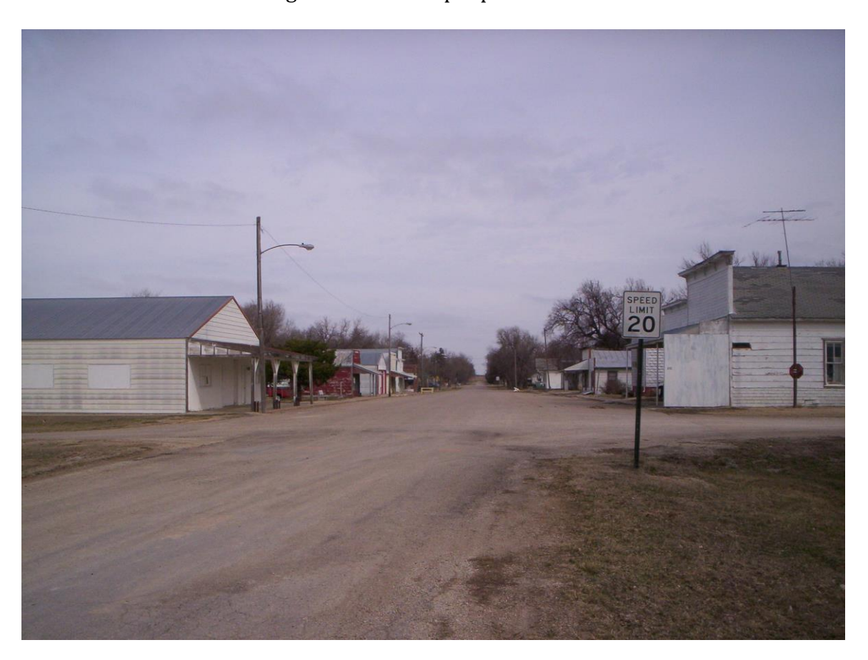
Figure 9: A photograph of Main Street as it looks today. Despite the loss of many of the old buildings (and the growth of many trees), it still looks similar to the first photo (Figure 4) from 1908.

It seems that Ramona began to slow down around the 1930s, when the automobile had gained popularity and the railroads were on the decline. With fewer people coming through by train, and more of them using the highway that bypasses Ramona, the population slowly leveled off and remained around a hundred people for the next 80 years. As the population decreased, it must have become tougher for businesses to keep running like they used to, and once they began to close, there would be even less encouragement for new people to move into town.