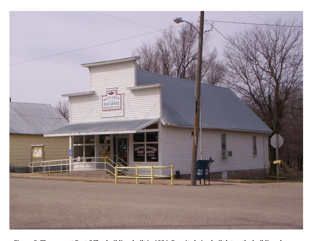
Figure 8: The current Post Office building, built in 1936. Despite being built later, the building shares many similarities with the earlier shops of Ramona, such as the Strickler General Store seen in Figure 4. (Photograph by Natalie Hilburn. March 16, 2013.)

the lesser-used offices. Ramona was one of the first to be targeted, and was scheduled for closing in January of 2012.<sup>24</sup> Because the post office is one of the few remaining businesses in Ramona, and possibly the only thing keeping it on the map, the local residents began massive letter-writing campaigns and efforts to increase the sale of stamps from the post office and keep the revenue high enough to allow the office to stay.<sup>25</sup> For now the Ramona Post Office has been guaranteed that it will remain in business until 2014, but it's still uncertain what will happen once that time runs out.