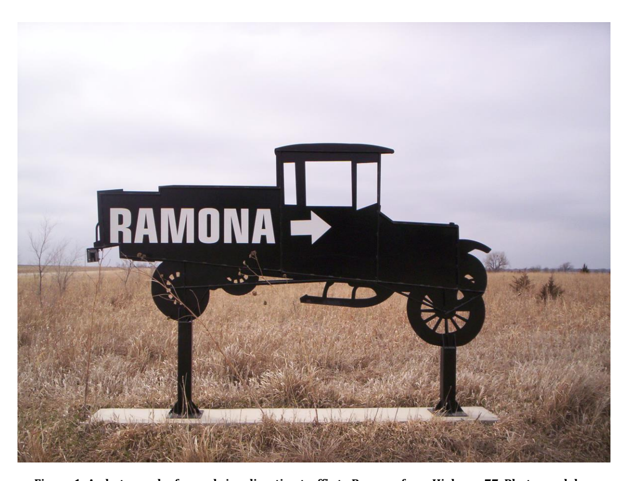
Figure 1: A photograph of a road sign directing traffic to Ramona from Highway 77. March 16, 2013.

Chapman Center for Rural Studies, Spring, 2013