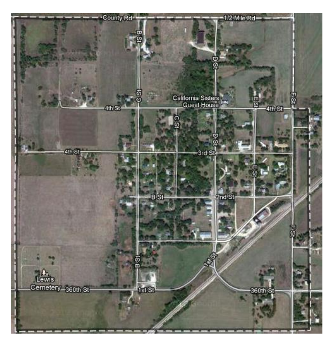
Figure 3: A satellite view of Ramona today. When compared to the plat map, it becomes apparent that many of the roads and "blocks" that had been planned out never reached completion. For reference with other photos and descriptions in this paper, "Main Street" is labeled as "D St." The main shops and public buildings can be seen at the southern end of D Street, before the road curves.

Originally the man who sold the land to the Golden Belt Company wanted the town to be named "Shields" after the area's first school teacher, J.B. Shields.<sup>8</sup> However, Shields, Kansas, already existed, and a new name had to be chosen. There are a few theories as to how Ramona got its final name. The first is that Ramona was